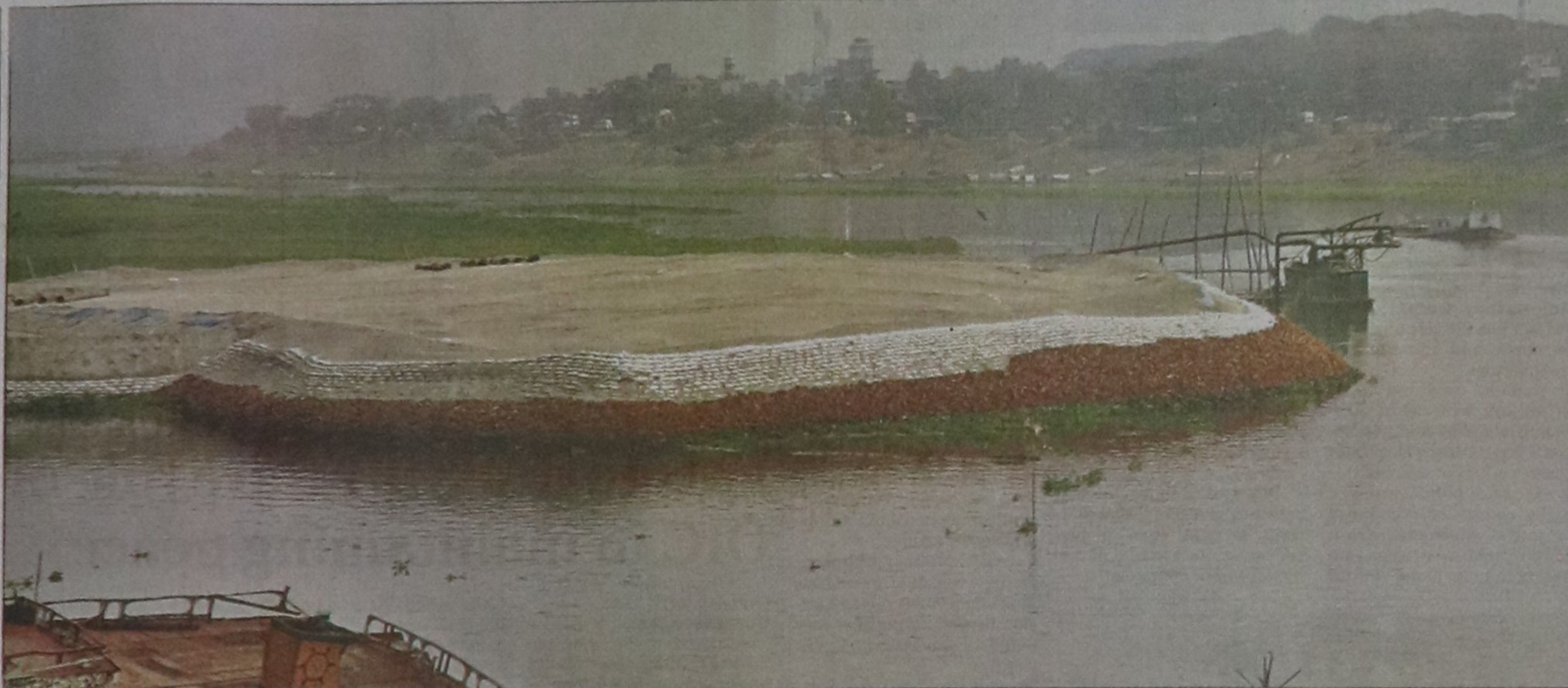
A vested quarter fills up a portion of the Turag near Sinnirtek to sell plots to people. The photo was taken from Mirpur flood embankment across the river.

UNB, Dhaka Prime Minister Sheikh Hasina yesterday congratulated Dr Manmohan Singh on his assumption of office as Indian prime minister for a second term. In a message of felicitation, Hasina hoped that the existing bilateral relations between the two neighboring countries would be strengthened further in the days to come. The prime minister wished good health, happiness and long life of Manmohan Singh and success of his government. Manmohan Singh was sworn in as prime minister yesterday along with the induction of his 20-member new coalition government. He is the first Indian prime minister since the country's post-independence leader Jawaharlal Nehru, to return to the office for a successive term.