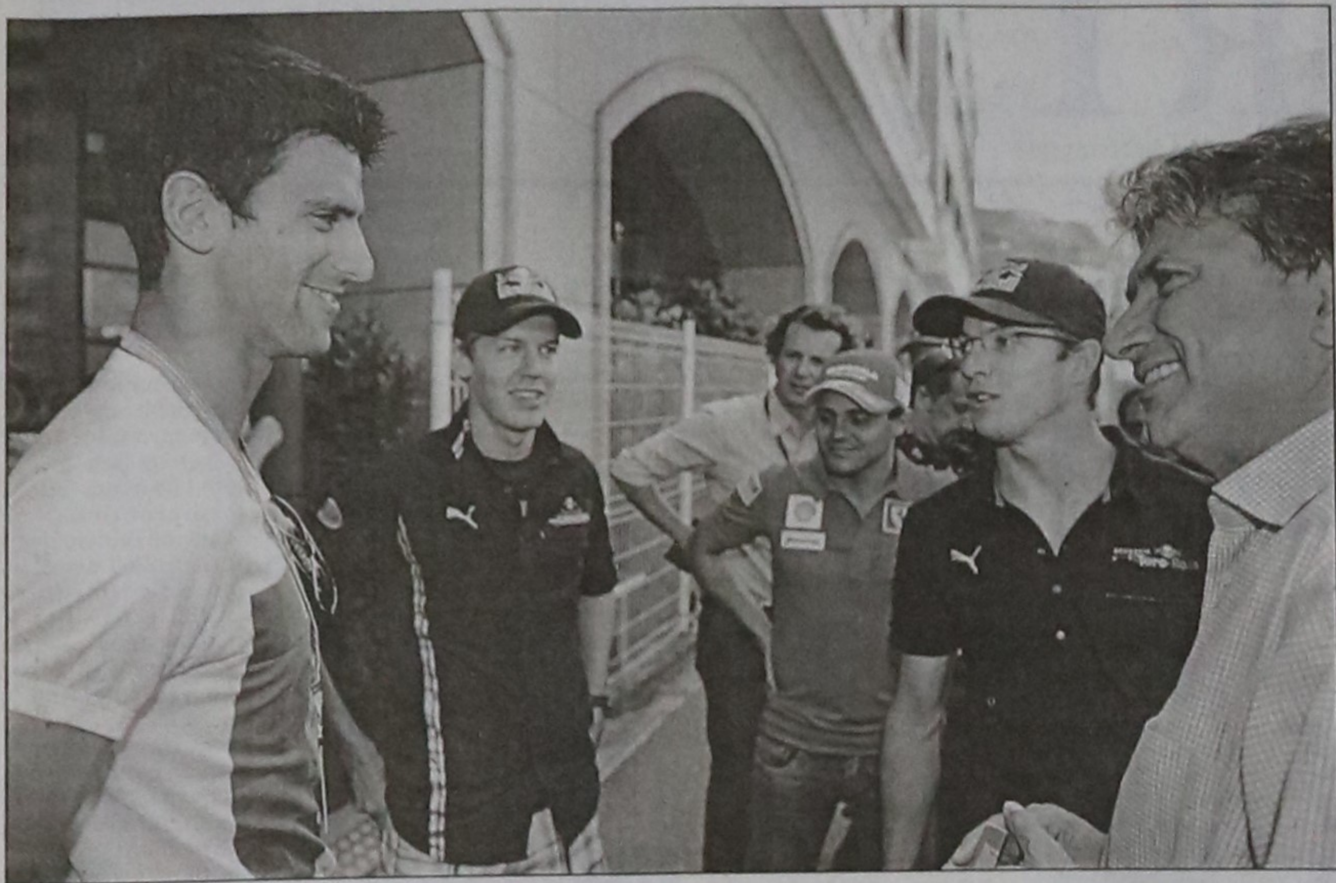
Serb tennis star Novak Djokovic (L) meets (from L-R) Red Bull's German driver Sebastian Vettel, Ferrari's Brazilian driver Felipe Massa and Toro Rosso's French driver Sebastien Bourdais in the paddock of the Monaco racetrack in Monte Carlo on Wednesday. The Monaco Grand Prix is on May 24. Djokovic is also in France to in the French Open that too begins on May 24.