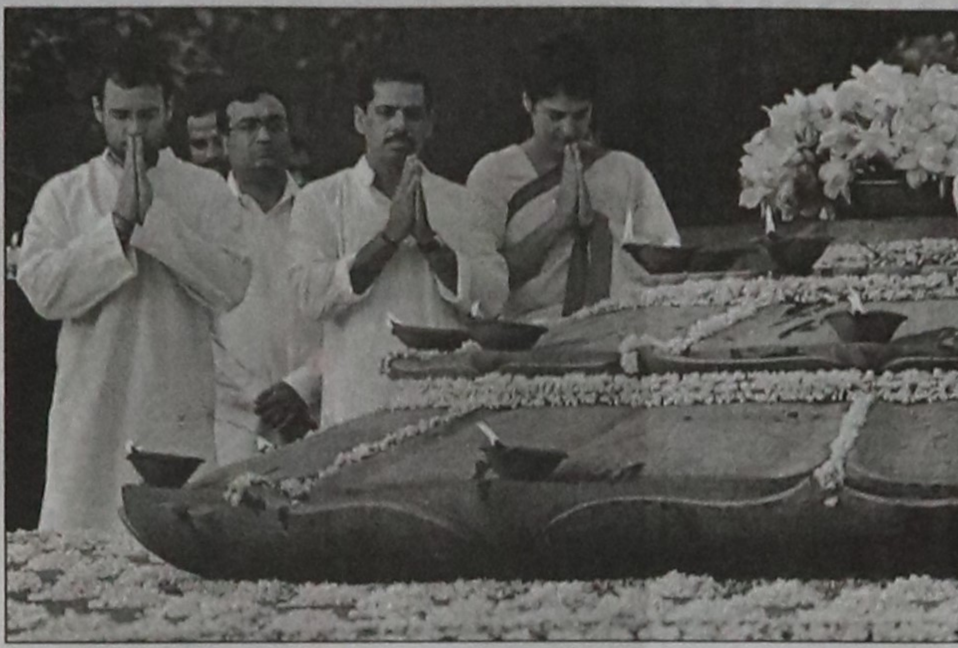
Rahul Gandhi, (L), Congress Party General Secretary and son of Congress Party President Sonia Gandhi and his sister Priyanka (R), accompanied by her husband Robert Vadra (2R), pay tribute to their father during a memorial ceremony for slain former Indian Prime Minister Rajiv Gandhi on his 18th death anniversary, in New Delhi yesterday. Rajiv Gandhi was assassinated in 1991.

Those pandemics in 1918-1919 -- which killed an estimated 50 million people -- in 1957-1963 and 1968-1970 started off as mild but went through waves that became more lethal at their peak, often the second season, and had different impacts in different regions.