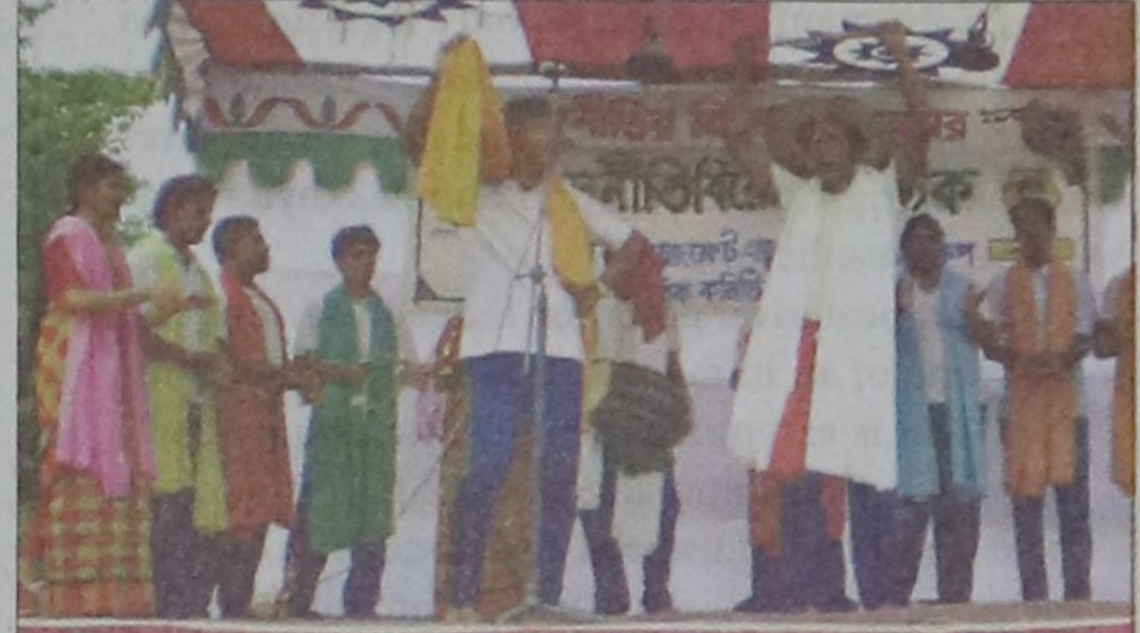
Members of the Youth Engagement and Support (YES) group perform in the play.