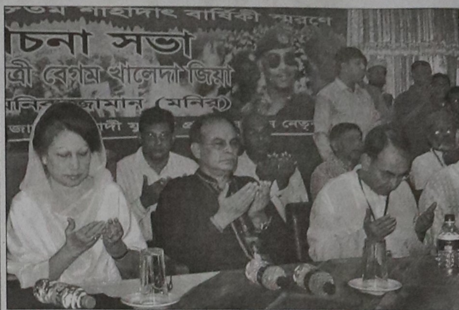
BNP Chairperson Khaleda Zia offers munajat during a discussion marking the 28th death anniversary of former president Ziaur Rahman at the Diploma Engineers' Institute Auditorium in the city yesterday. Jatiyatabadi Jubo Dal organised the event.