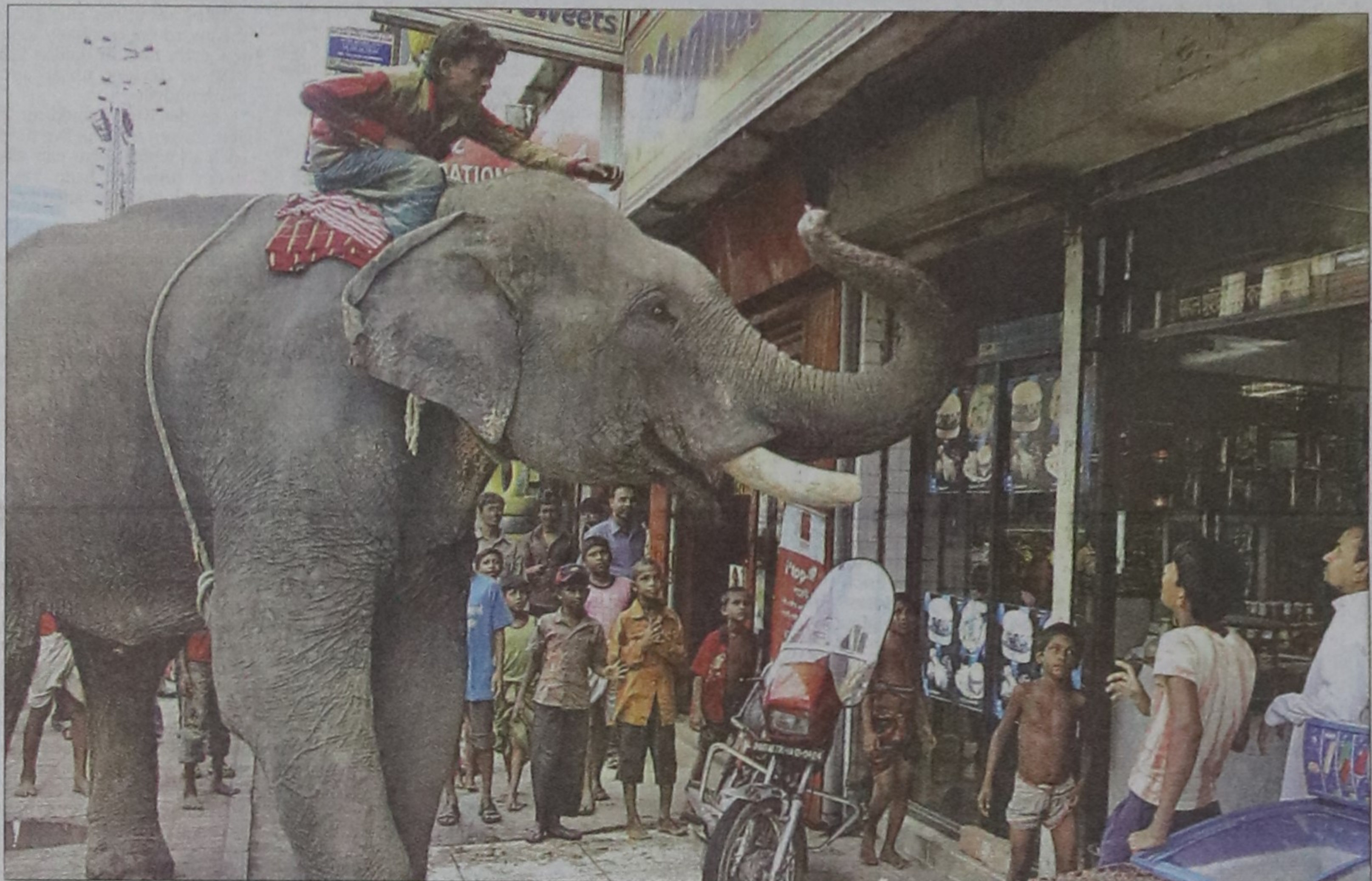
An elephant is used in an innovative way to collect fund for the circus. This photo taken at Tejgunipara in Tejgaon yesterday shows the elephant receiving money from a shop with its trunk.