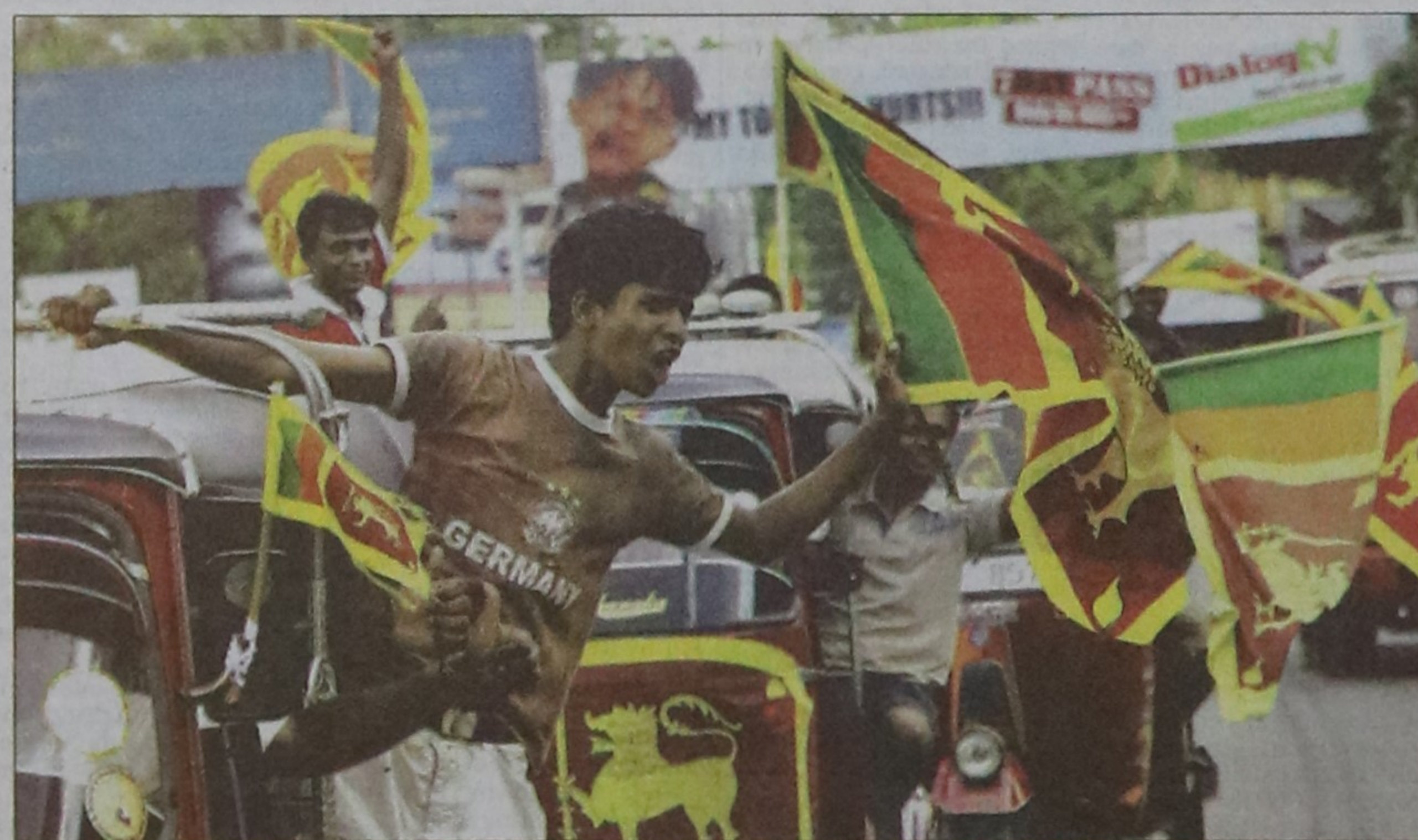
Sri Lankans wave the national flag in Colombo yesterday as they celebrate their country's military victory over the Tamil Tigers.