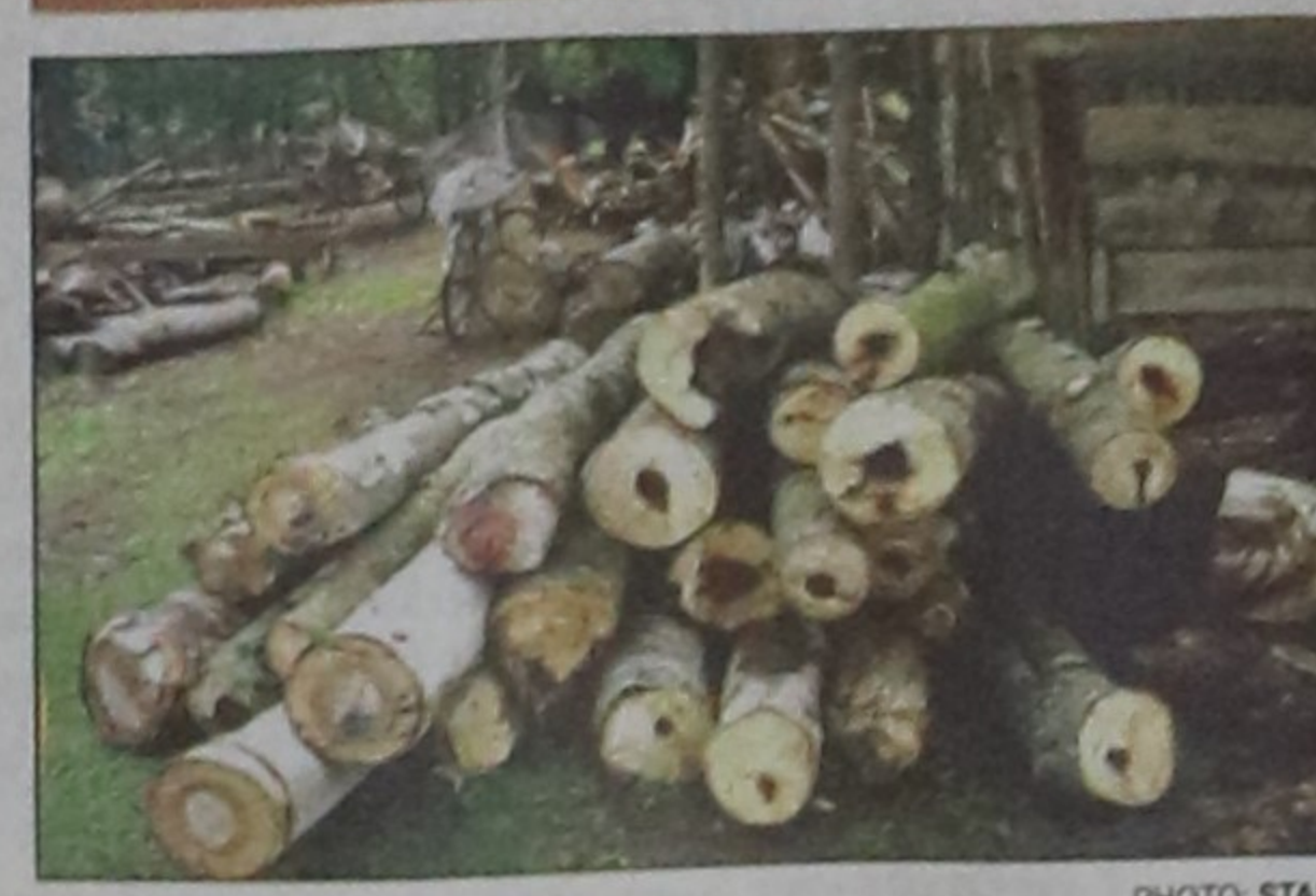
Timber procured from roadside trees in Shahjahanpur upazila of Bogra is kept on the yard of a sawmill. A member of Khottapara UP allegedly cut the trees on Saturday morning but he refuted the allegation saying that the trees fell down in a storm.