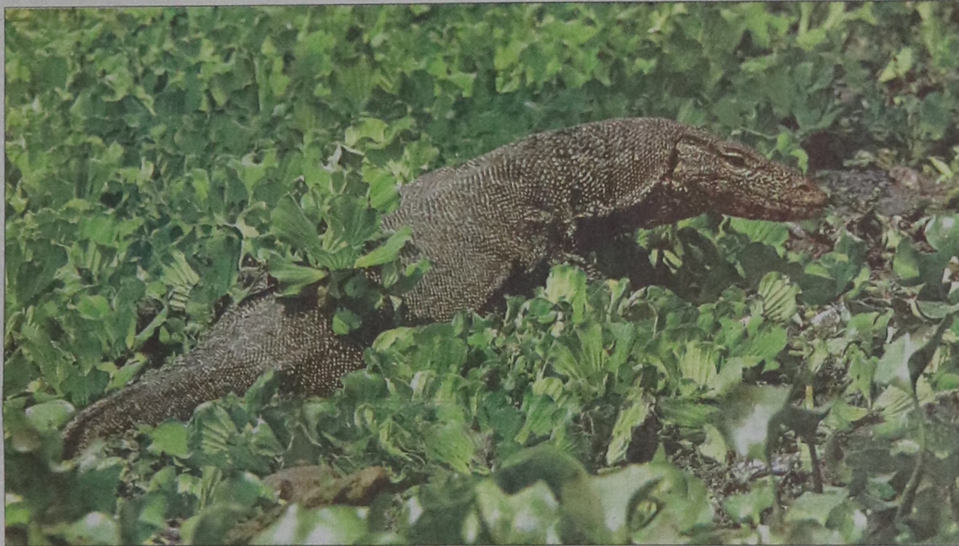
This reptile is called ring lizard, scientific name Varanus salvator , and it loves to live in and around fresh and marine waters. It grows as large as three metres weighing 15kg. This excellent swimmer can stay submerged for up to 30 minutes. This endangered species can even climb and jump off trees when required. Having a long list of things as diet helped them survive over the years. However, people killed them for their skins in the 70s and 80s. Now people kill these beautiful creatures with the excuse of stealing their poultry. The photo was taken at Nabiganj, a well-known lizard habitat in Narayanganj.