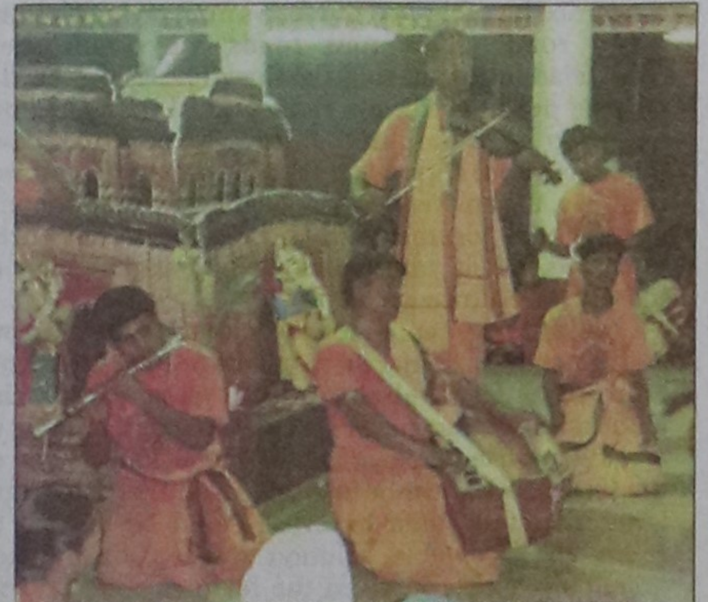
Kirtan singers from different districts performed at the event.

To celebrate the festival, kirtan singers from different districts including Netrakona, Sylhet, Sirajganj, Khulna, Mymensingh and Barisal gathered in Dinajpur.