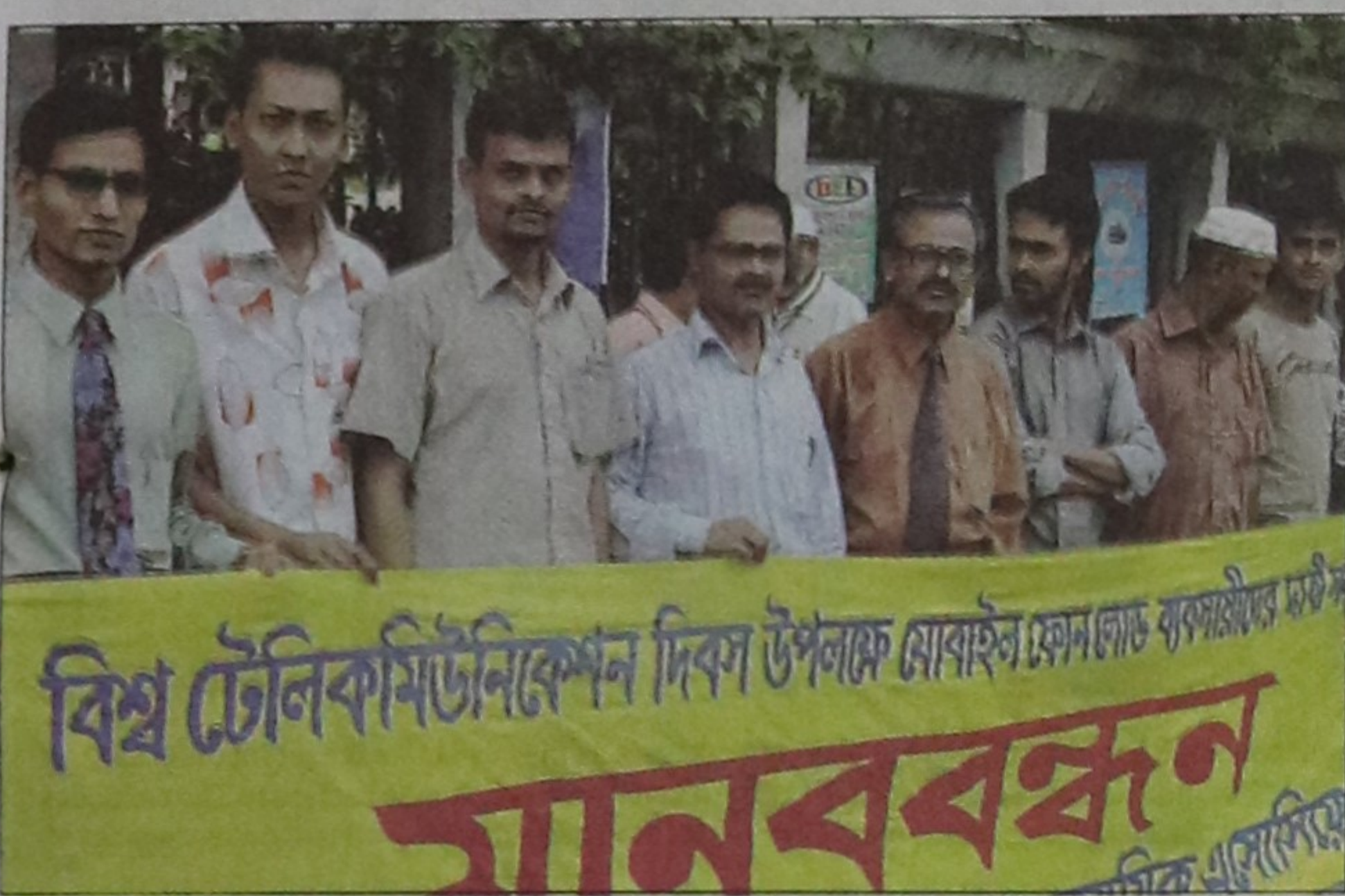
Bangladesh Mobile Phone Load Businessmen's Association forms a human chain in the city yesterday to mark the World Telecommunication Day.