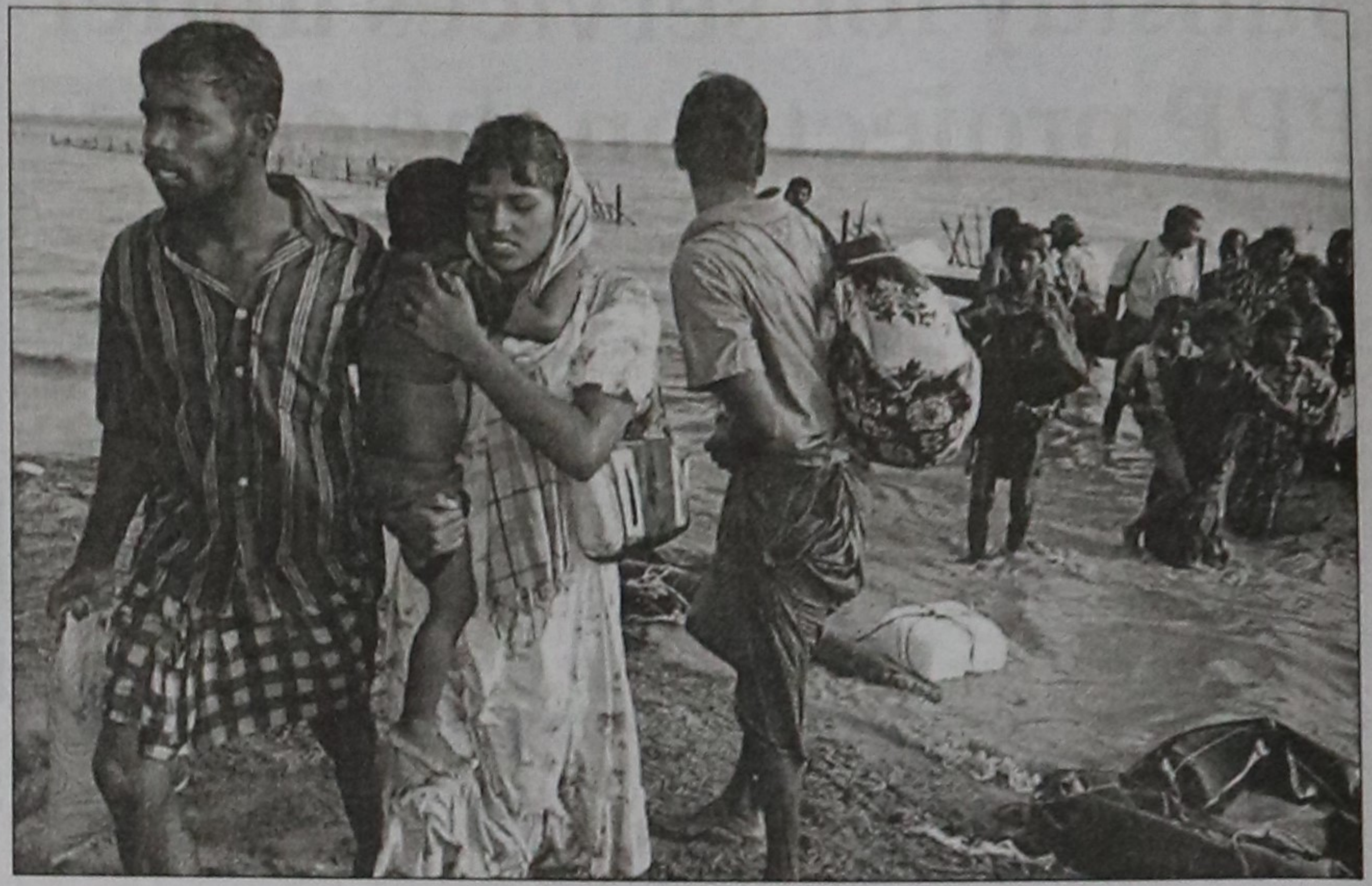
This handout picture released by the Sri Lankan Army yesterday shows civilians who managed to escape from the last remaining Tamil Tiger rebel-held patch of coastline in the northeastern district of Mullaitivu.

The UN says 7,000 civilians were killed and 16,700 wounded in the fighting from Jan. 20 until May 7, according to a UN document given to The Associated Press by a senior diplomat. Since then, doctors in the war zone say more than 1,000 civilians were killed in a week of heavy shelling that rights groups and foreign governments have blamed on Sri Lankan forces. Sri Lanka denies firing heavy weapons into the war zone.