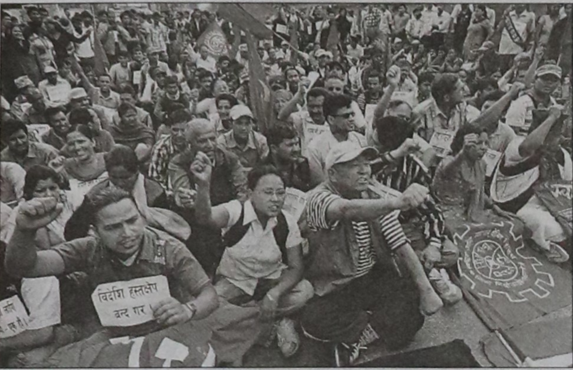
Supporters of the Unified Communist Party of Nepal (Maoist) chant slogans during a protest against Nepalese President Ram Baran Yadav in Kathmandu yesterday.