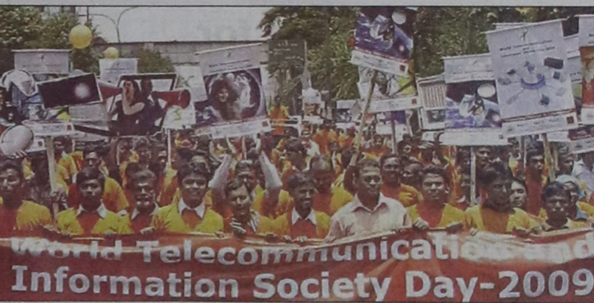
Banglalink takes out a procession at Chittagong city to mark the World Telecommunication and Information Society Day 2009 yesterday.