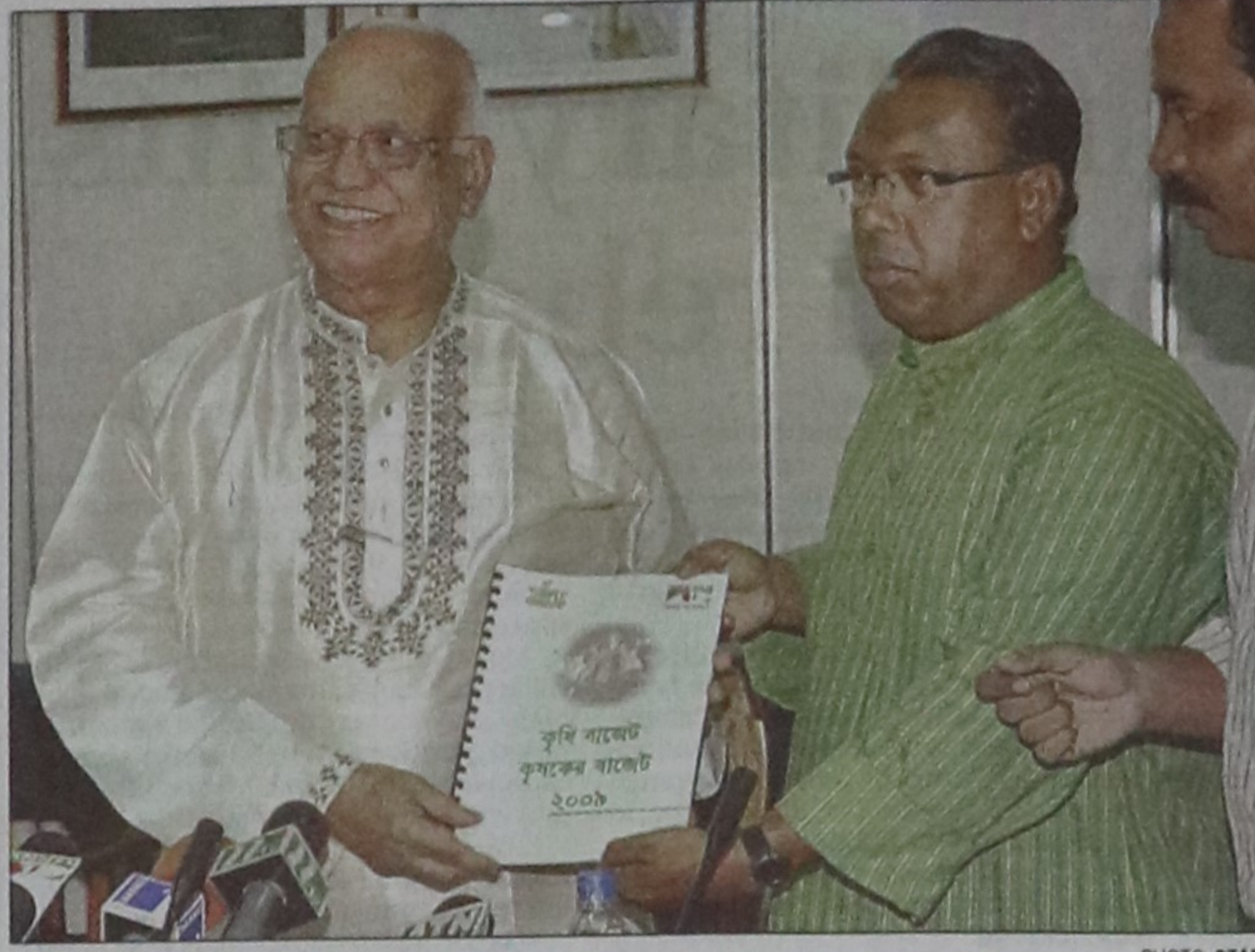
Channel I Director (news) Shykh Seraj hands over a book containing a 39-point recommendation on agriculture titled 'Krishi Budget Krishoker Budget' to Finance Minister AMA Muhith at the conference room of the ministry yesterday.

"The service charges will also be decided as per the negotiation on a particular project or service," the official said.