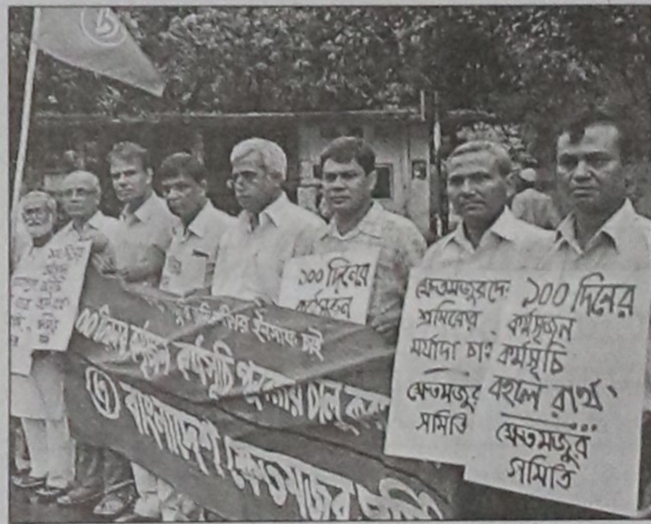
Bangladesh Khetmajur Samity forms a human chain at Muktangan in the city yesterday demanding steps to continue the 100-day employment generation programme of the government.