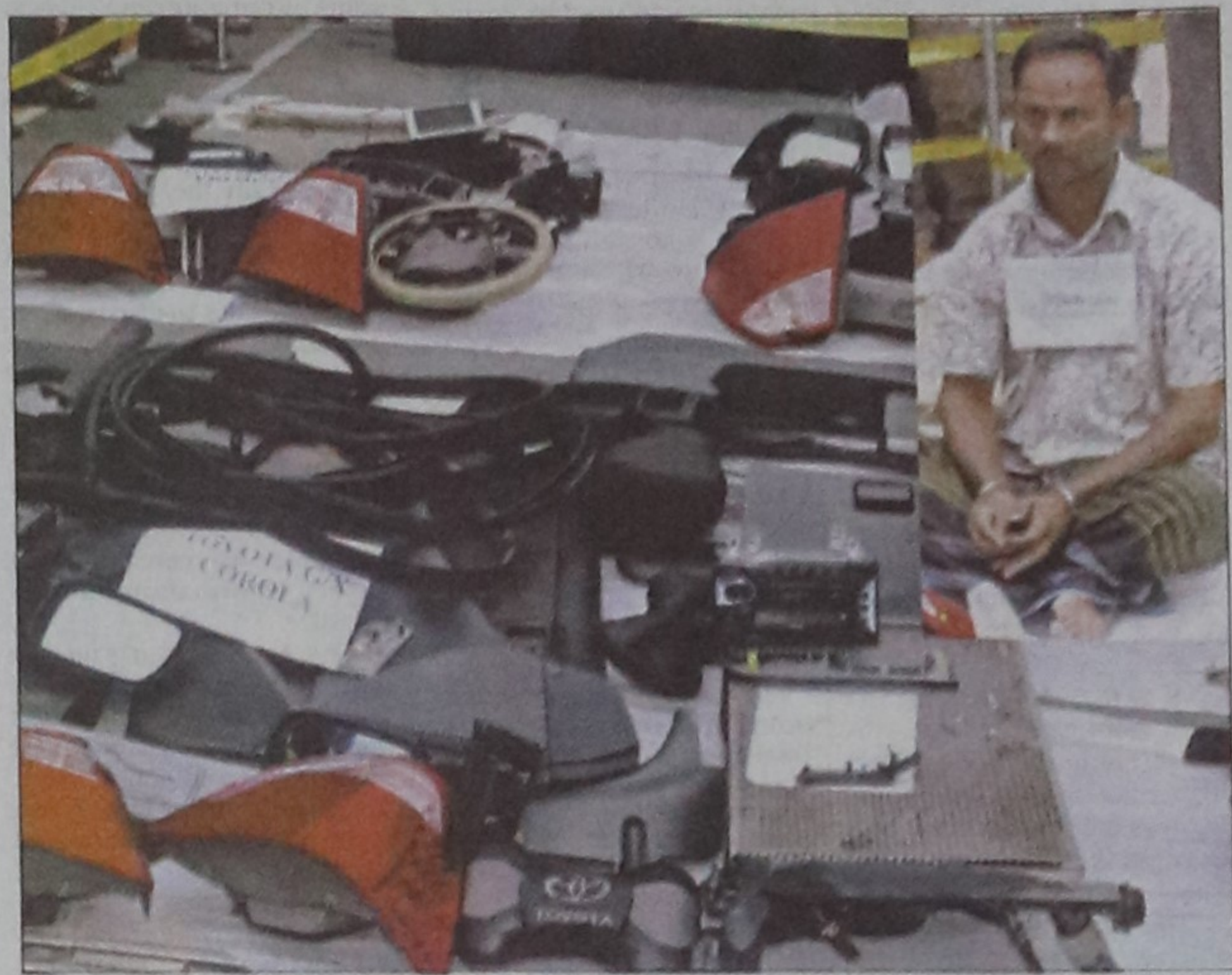
Detective police arrested a man (picture inset) in Narayanganj yesterday, with stolen car parts worth nearly Tk 40 lakh in his possession.