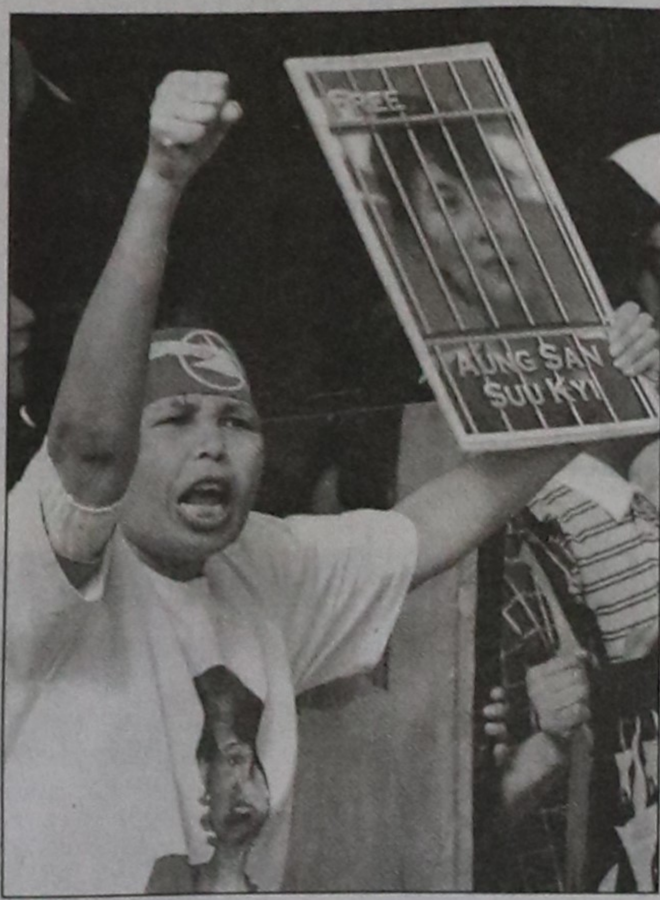
Myanmar citizens living in Japan hold portraits of Aung San Suu Kyi as they shout slogans during a rally in front of the Myanmar embassy in Tokyo yesterday.