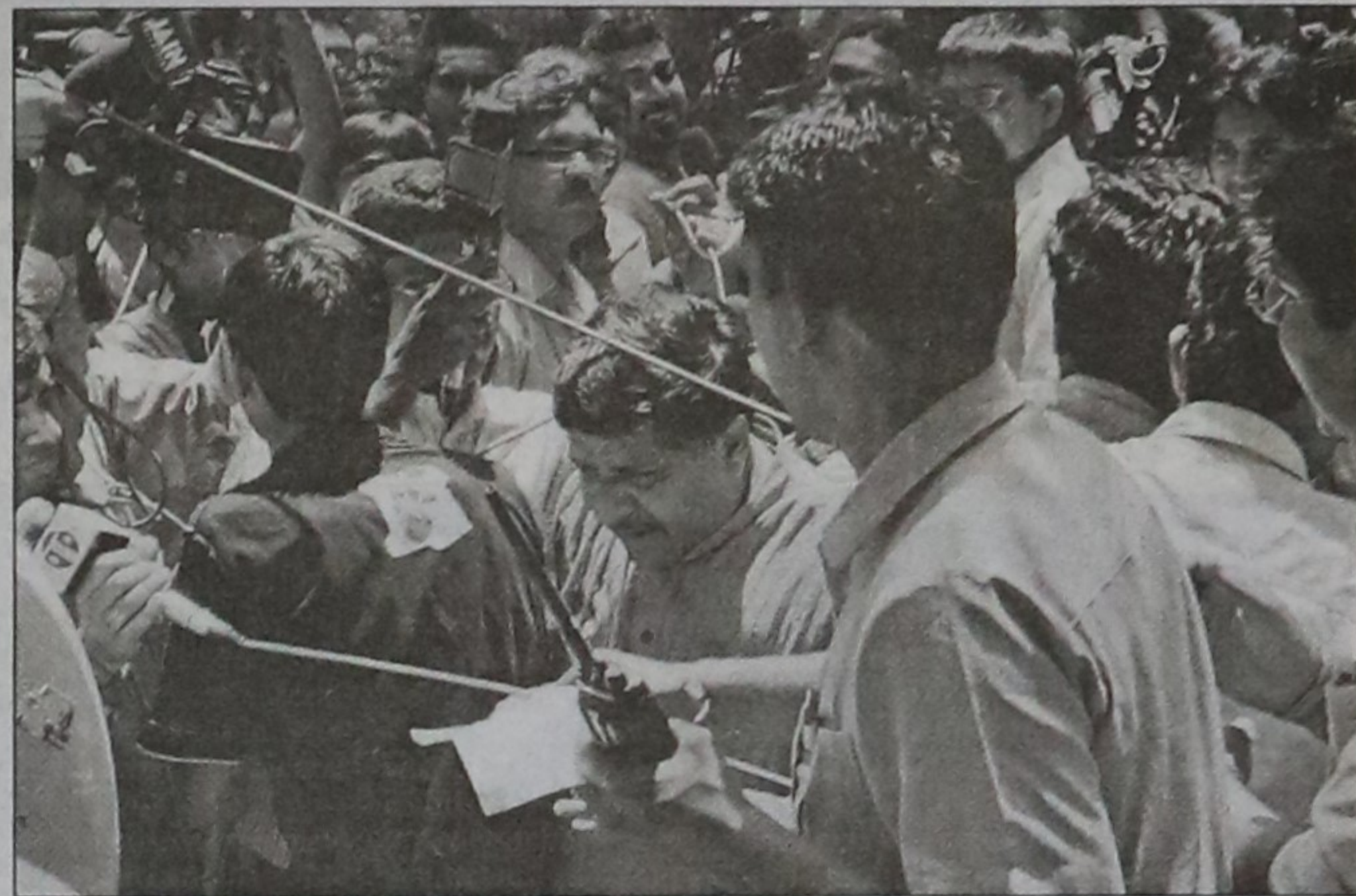
Senior Bharatiya Janata Party (BJP) leader Ravi Shankar Prasad (C) escapes the media in New Delhi yesterday after a BJP strategy session to discuss post polls alliances at the residence of prime ministerial candidate Lal Krishna Advani.

Exit polls by television channels Wednesday predicted that the Congress-led United Progressive Alliance (UPA) would finish just marginally ahead of the BJP-led National Democratic Alliance (NDA). The Third Front, made up of Communists and regional parties, is tipped to win around 100 seats.