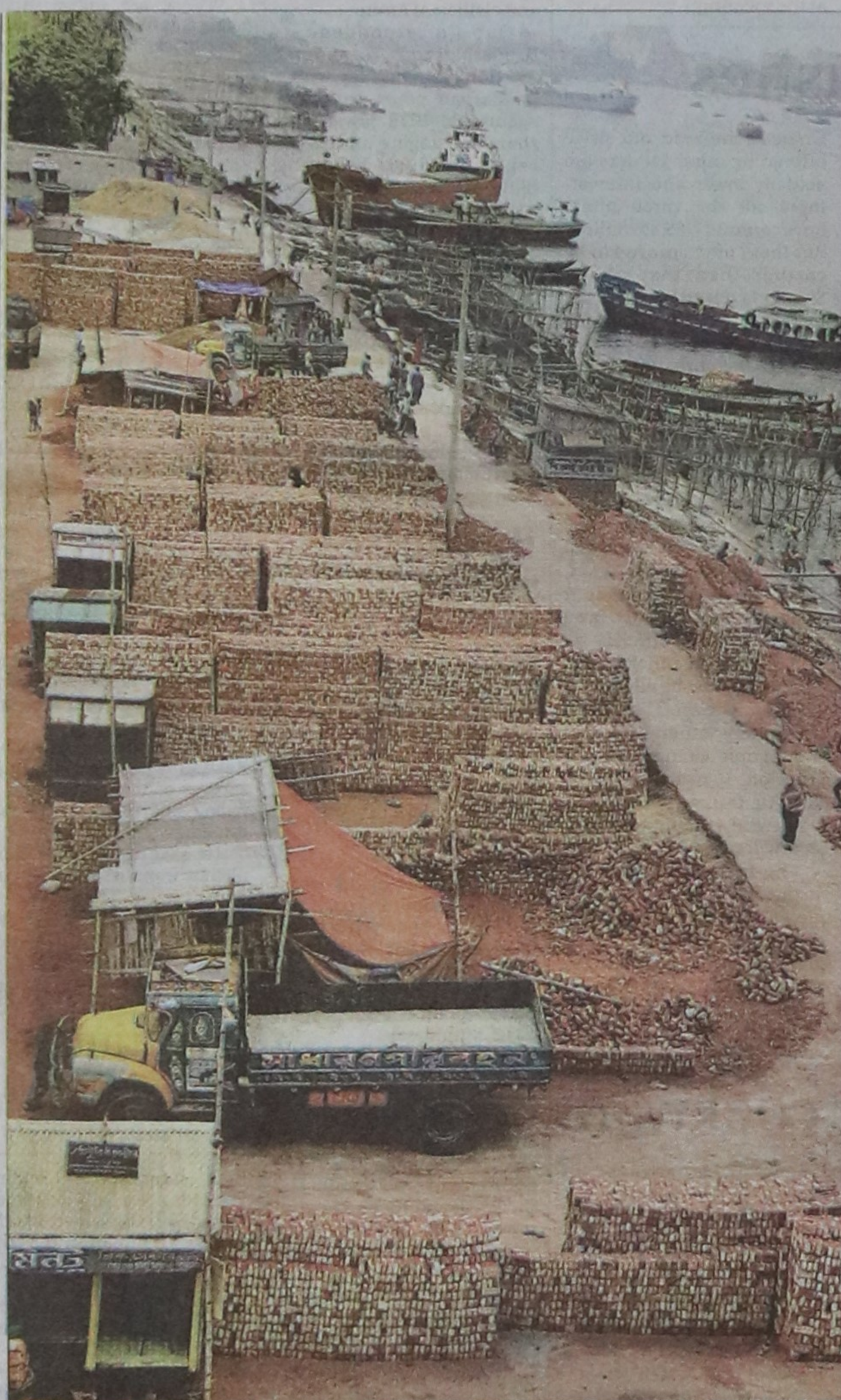
Brick kilns have resumed business on the banks of Buriganga despite being shut down during a BITWA drive earlier in the year. People say, these kilns near the second bridge on Buriganga are owned by 'influential' people.