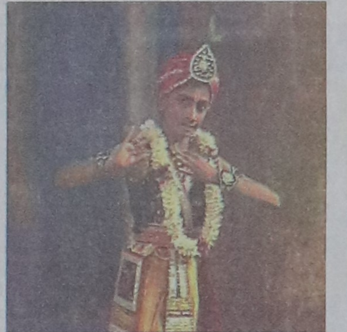
Competitors will perform solo on tonight's episode.