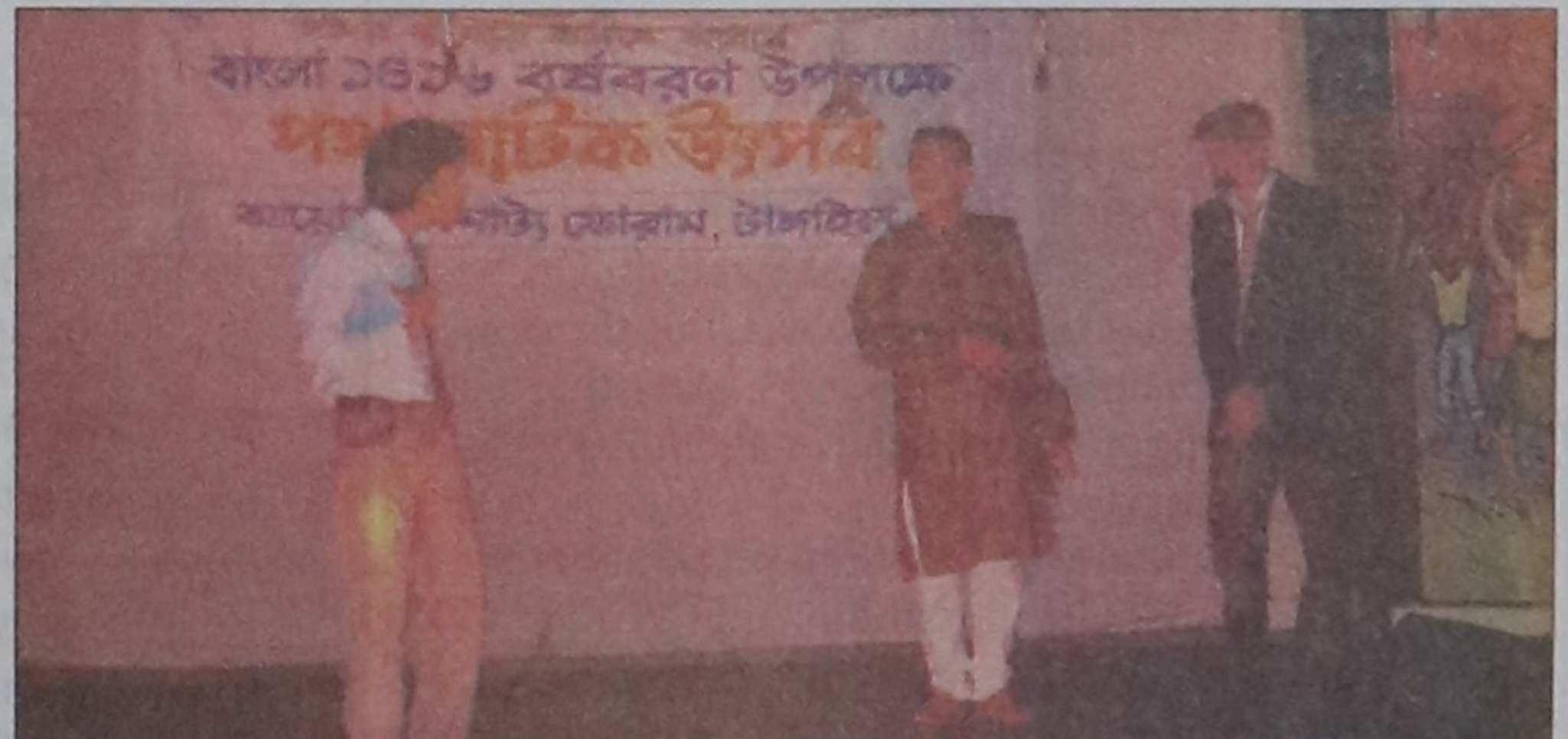
A scene from "Panta Akalee" staged on the inaugural day.