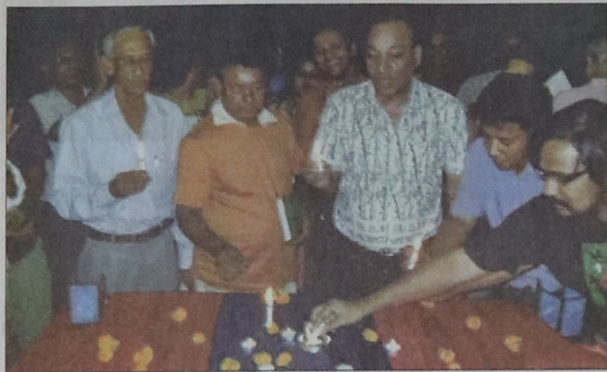
Eminent theatre personalities seen at the inauguration of Augusto Boal Centre, a branch of Bot Tola.