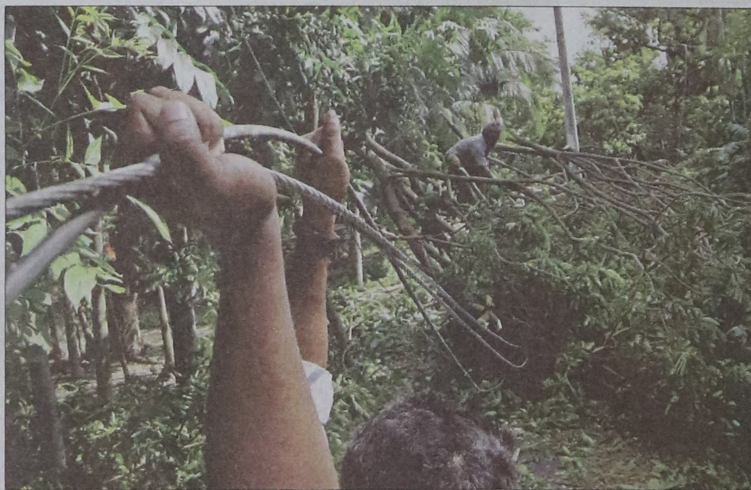
People try to remove a tree that severed electric cables before landing on road during yesterday's nor'wester at Kazipara of Louhajang in Munshiganj.