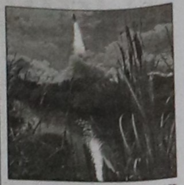
The US space shuttle Atlantis lifts off on Monday at Kennedy Space Centre in Florida on the final shuttle mission to service NASA's Hubble Space Telescope.

Initially run by the military, the administration of Manik Farm is now handled by the civilian authorities, although soldiers remain in charge of security.