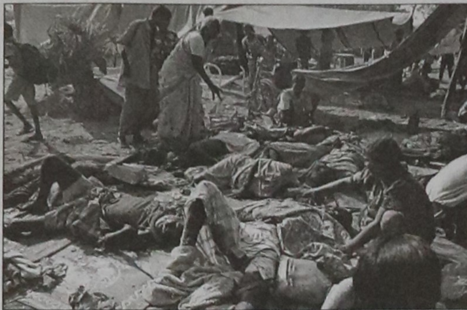
This undated handout picture received yesterday from pro-rebel LTTE organisation Tamilnet.com website shows what it claims are patients at a makeshift hospital in Mullivaikkal, which housed a total of 2,000 patients at the time of an alleged Sri Lankan army artillery and mortar attack that killed 49 on Tuesday morning.

agenda of the 15-member council as some powerful members, notably China and Russia, are opposed.