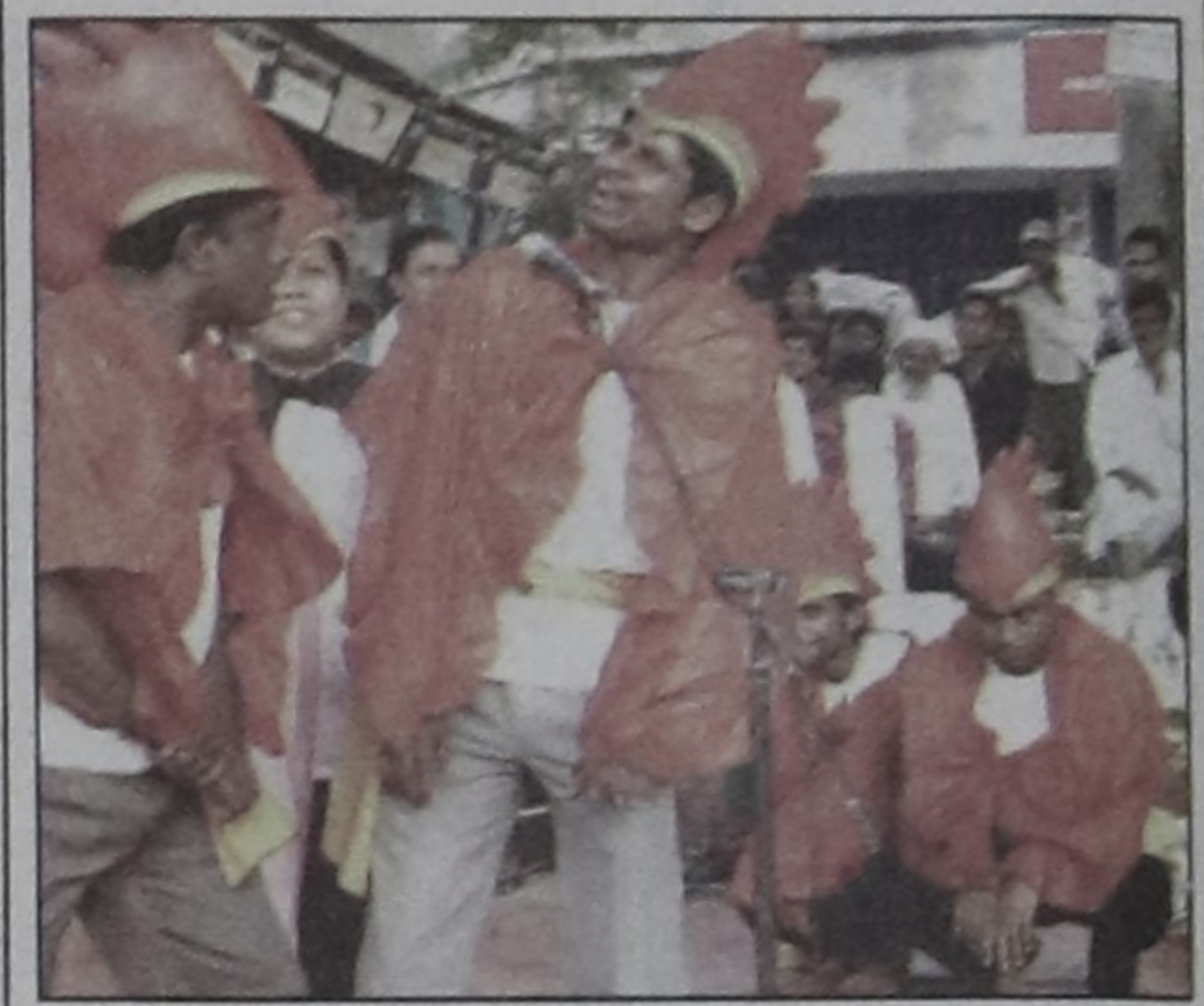
A scene from drama 'Kukkuru' that was staged on Shapla Chattar in Teknaf pourasava under Cox's Bazar district yesterday.