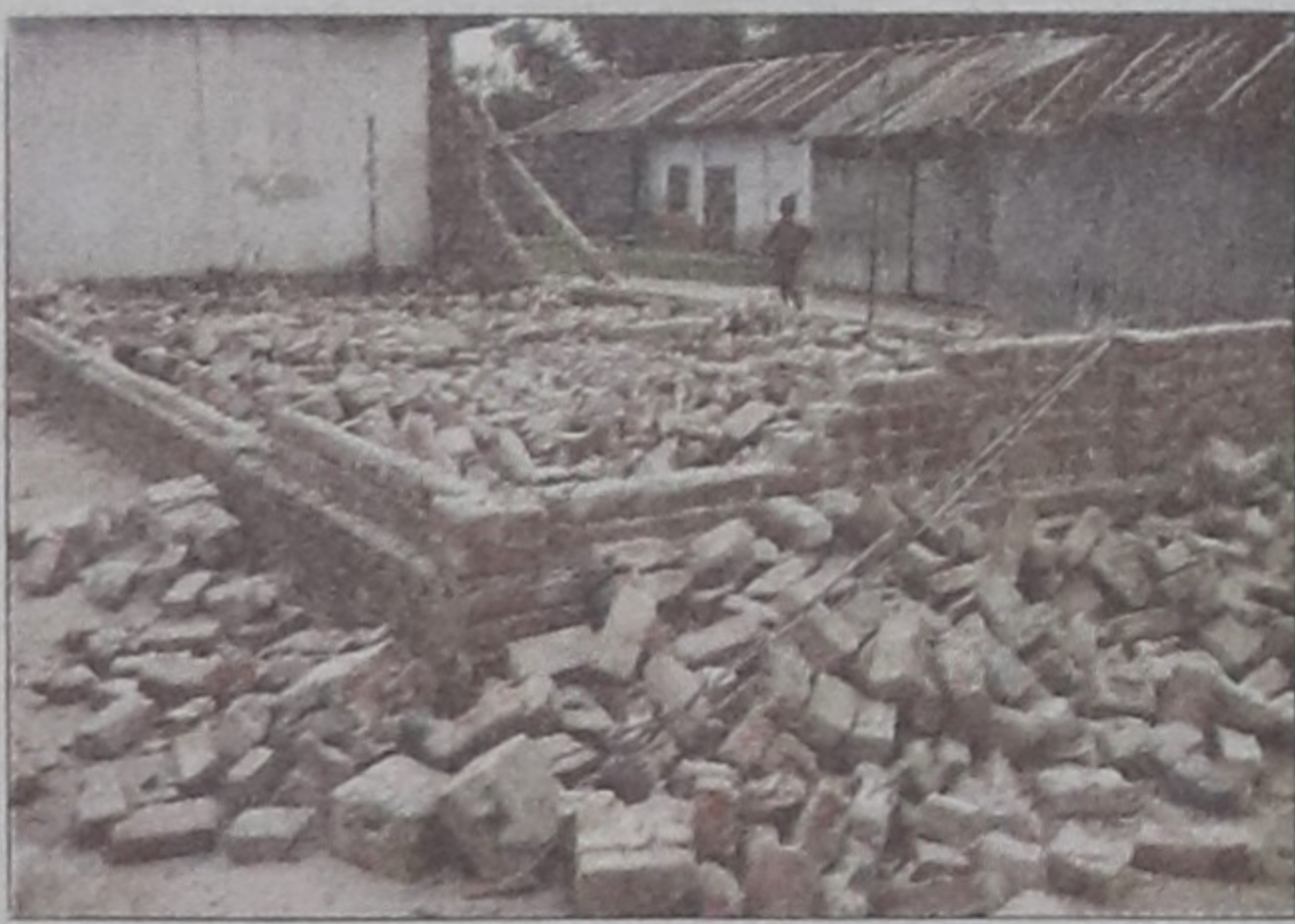
A room of Balapukur High School in Aditmari upazila collapsed on Saturday night, only five months after its construction.