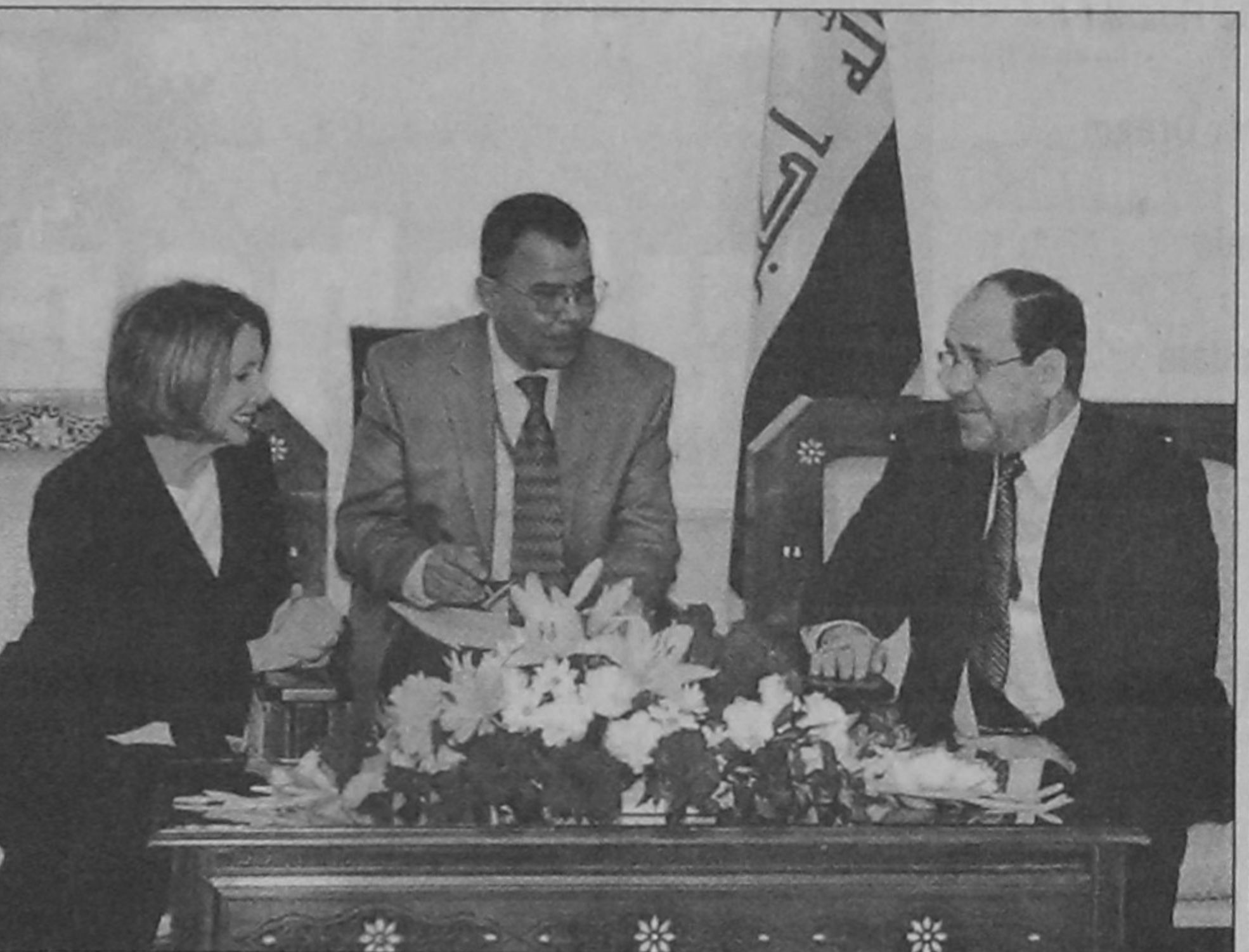
Handout photo shows US House of Representatives Speaker Nancy Pelosi (L) meets with Iraqi Prime Minister Nuri al-Maliki at his offices in Baghdad. Pelosi was in Baghdad to meet senior Iraqi and US officials.