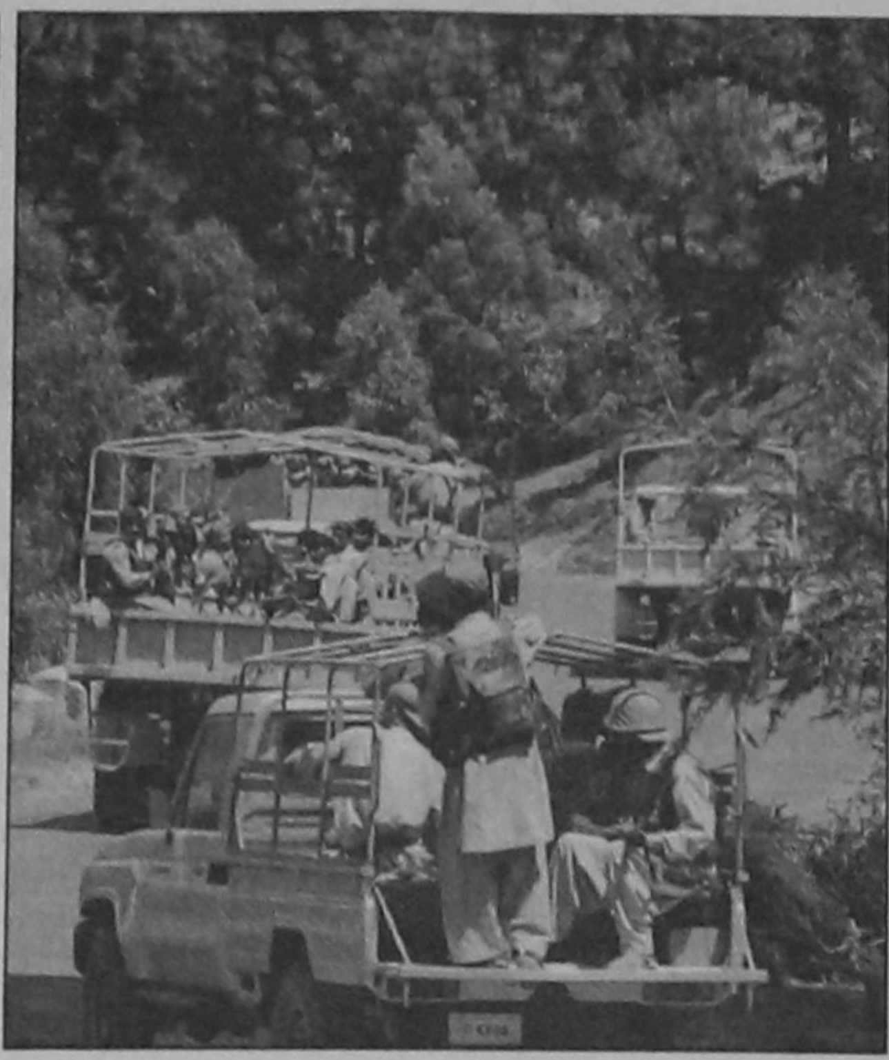
A convoy carrying Pakistani troops head towards Swat valley from Buner yesterday. More than 100,000 panicked people fled Pakistan's northwest as the government briefly relaxed a curfew to allow civilians to escape a fierce onslaught against Taliban insurgents.