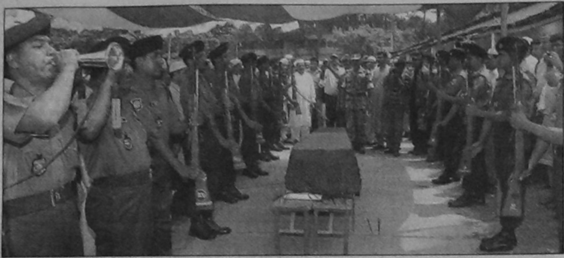
Eminent nuclear scientist Dr MA Wazed Miah, husband of Prime Minister Sheikh Hasina, was given a guard of honour before his burial at the family graveyard at Fathepur under Pirganj upazila in Rangpur yesterday. (Story on Page 1)