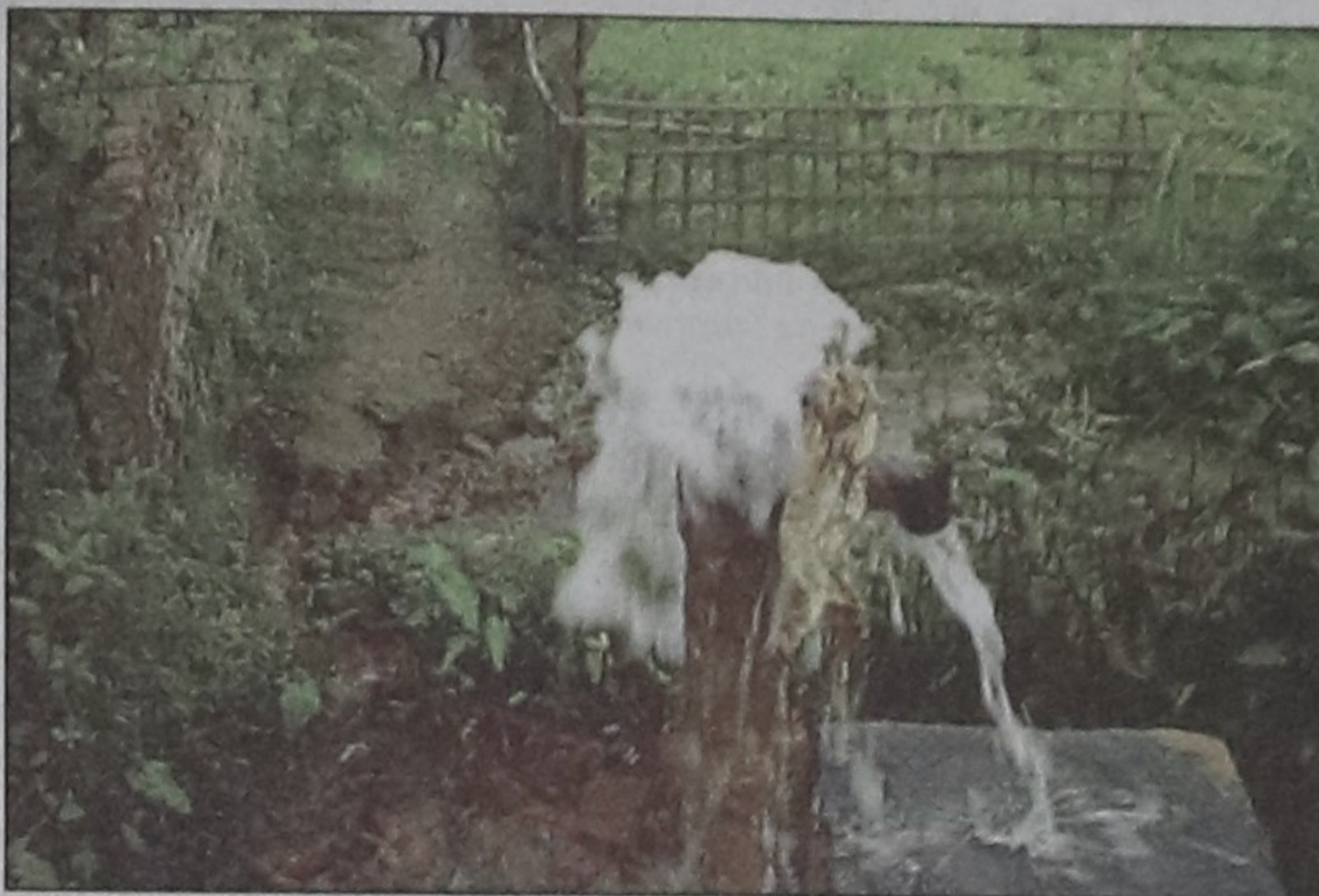
This tube-well, like other ones at Shyampur and Anandapur villages near Titas Gas Field in Brahmanbaria, is continuously emitting water and oil due to pressure from underground gas, left, gas from under the riverbed creates bubbles at different points of the Titas as the area has been witnessing gas emission for the last 4 years.