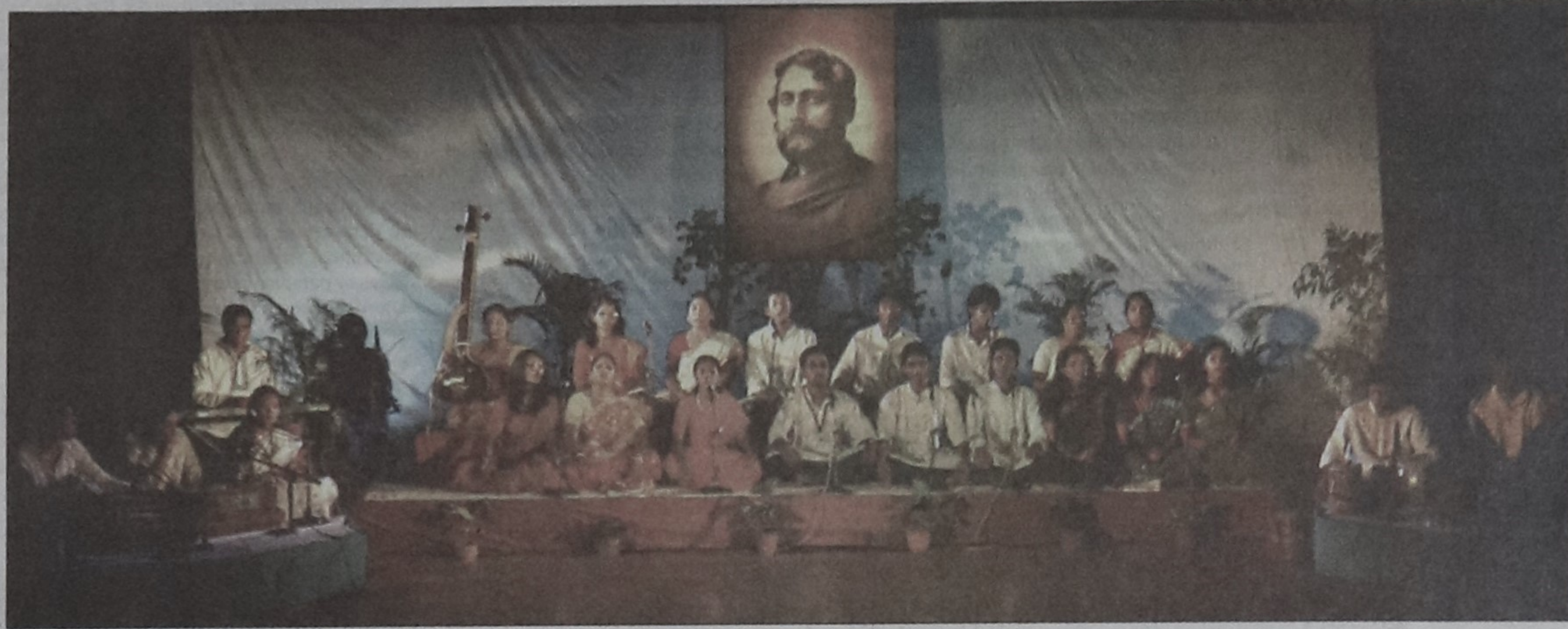
The bard remembered: (top) Artistes of Chhayanat and in Kushtia celebrate Tagore birth anniversary with fervour.