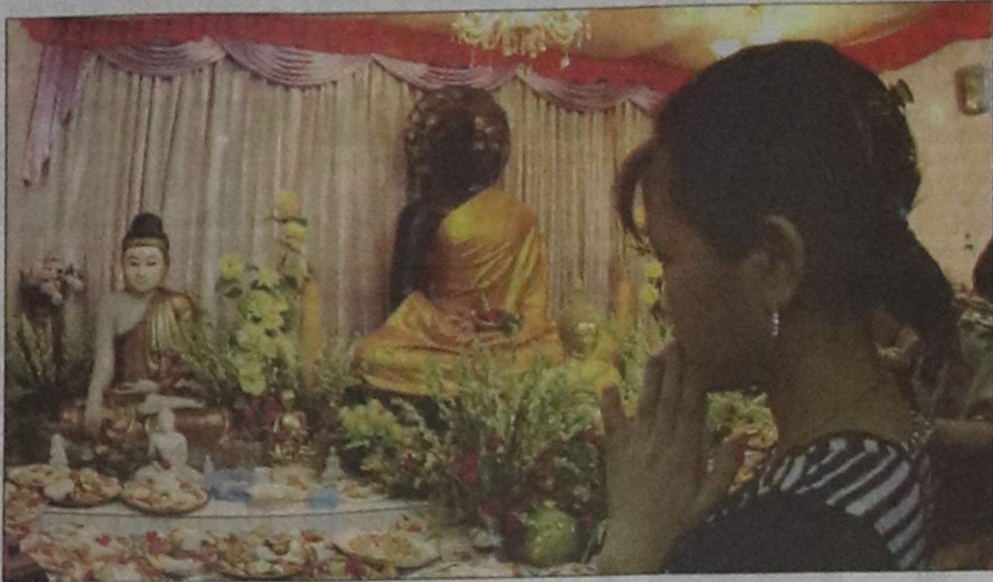
A devotee offers prayers at Kamalapur Bouddha Bihar in the city yesterday on the occasion of Buddha Purnima.