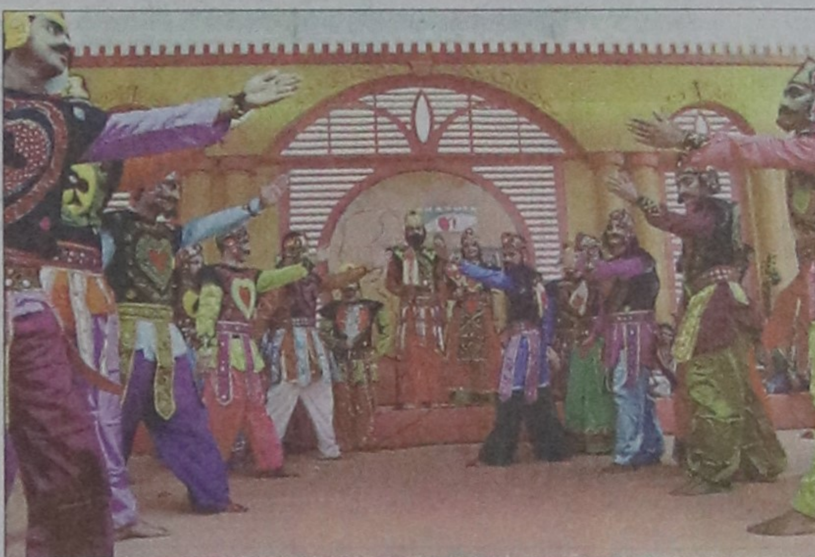
Artistes of Sur-er Dhara stage "Tasher Desh."