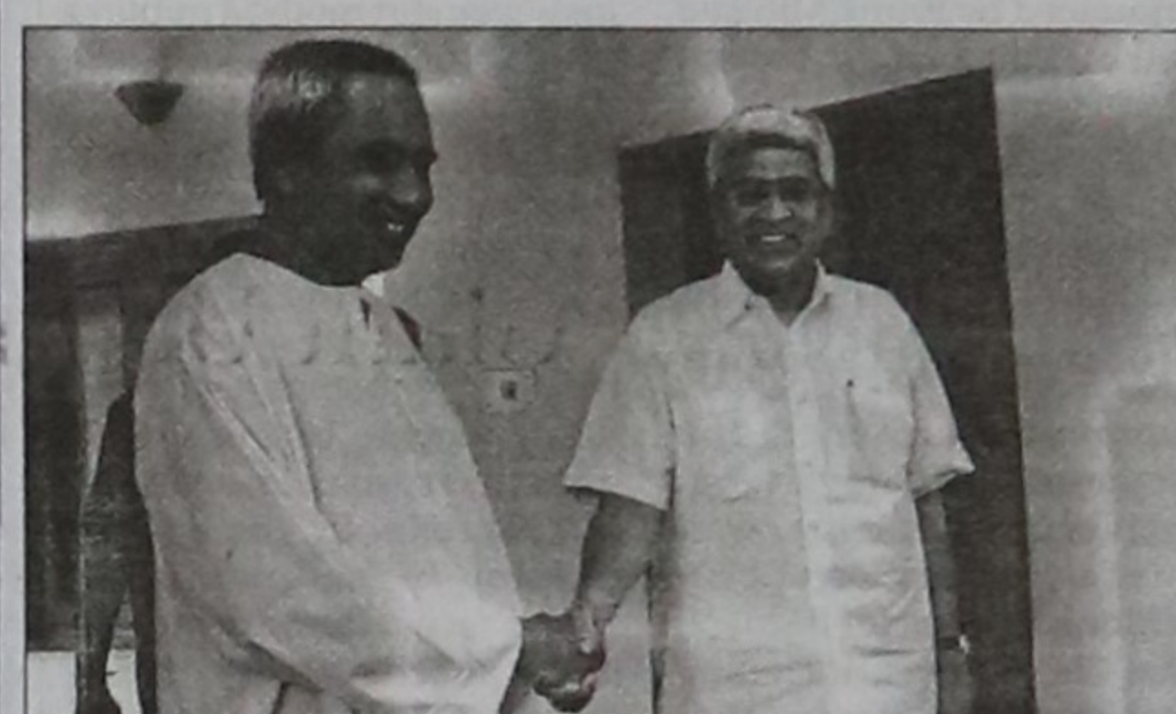
Orissa state Chief Minister Naveen Patnaik bids farewell to Communist Party of India (Marxist) (CPI-M) All India General Secretary Prakash Karat after their meeting at Naveen Newas in the eastern India temple city Bhubaneswar yesterday.