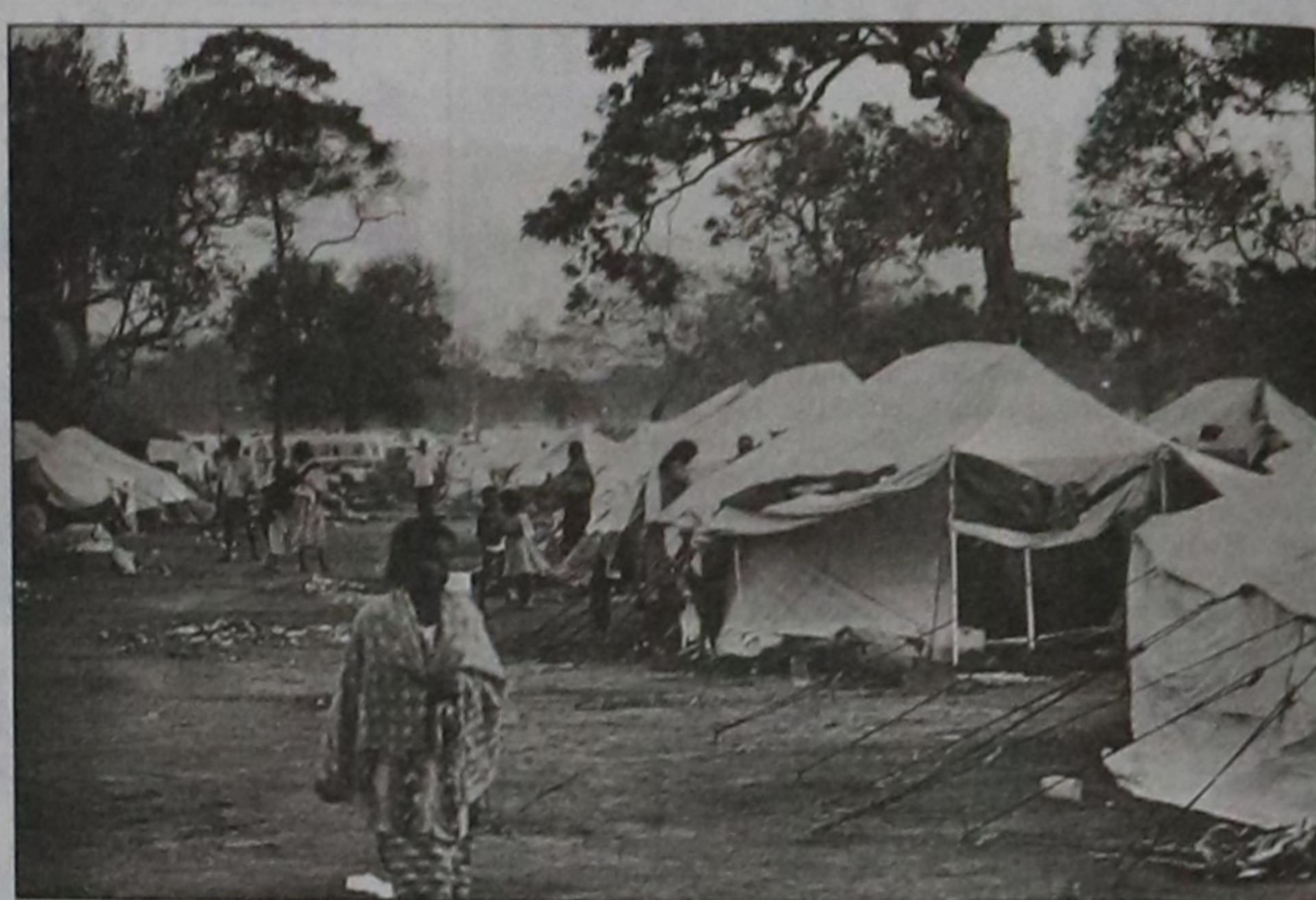
Displaced Tamil civilians camp inside Manic farm in the northern Sri Lankan district of Vavuniya on Thursday. Around 50,000 internally displaced people (IDP) from Puttimalan live in camp after they were relocated due to the armed conflict between the Sri Lankan army and the LTTE.

Rajapakse, under pressure over allegations that his troops have been shelling civilians, on Wednesday invited UN Secretary General Ban Ki-moon to visit the island.