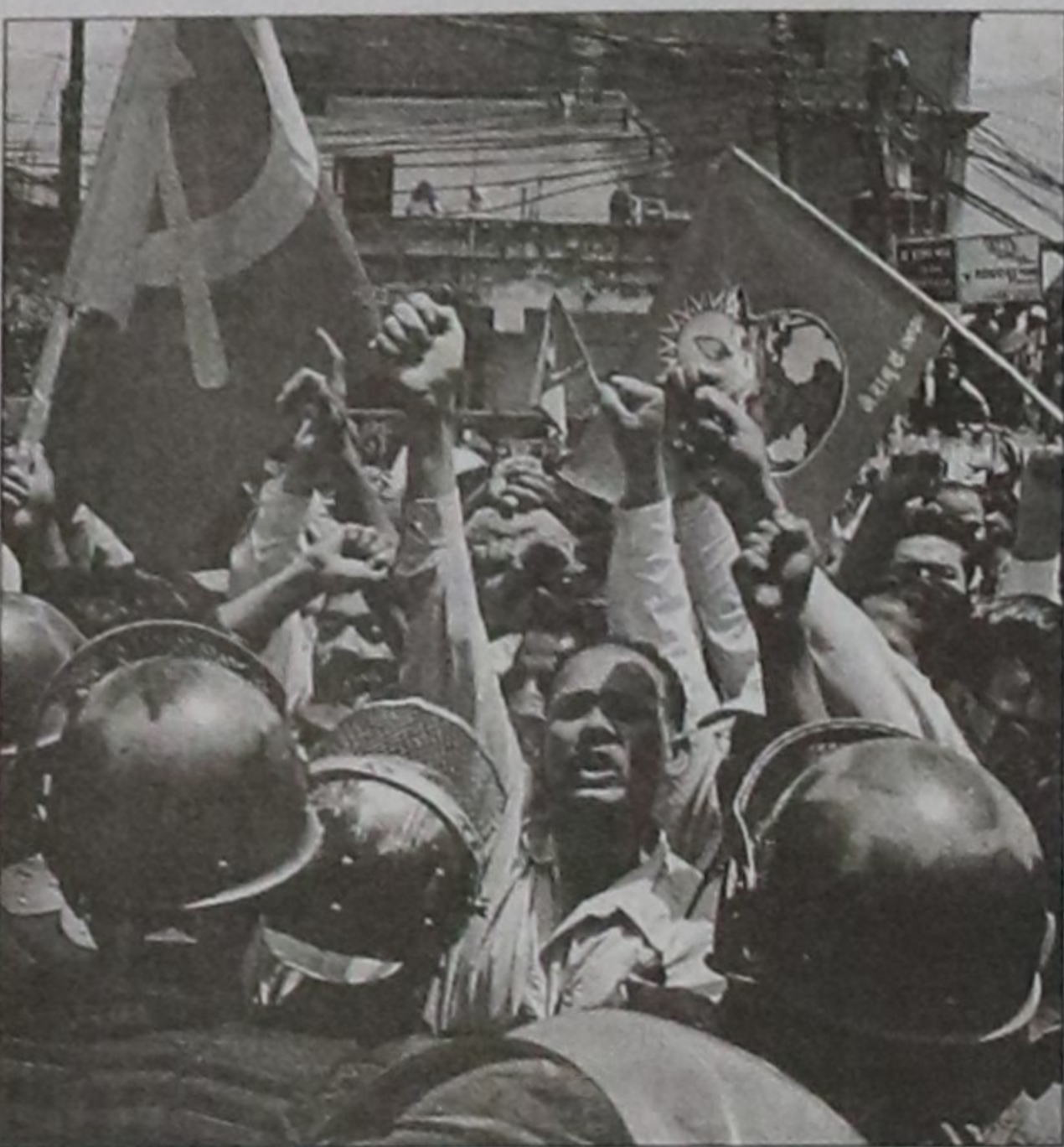
Supporters of the Unified Communist Party of Nepal (Maoist) chant slogans against Nepalese president Ram Baran Yadav during a rally in Kathmandu yesterday.