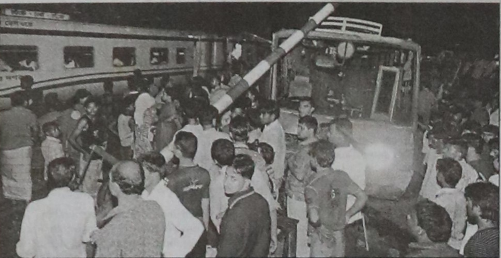
Onlookers gather at a level crossing at Khilgaon in the city after a collision between a train and a bus took place last night. At least two persons were injured in the accident. Witnesses said the Sylhet-bound train hit the bus of Saudia Silk Paribahan which moved onto the level crossing pushing through a barrier as the bus driver lost his control over the steering.

Brac started its operations in Uganda in 2006 and has quickly grown to become one of the largest micro credit providers in the country.