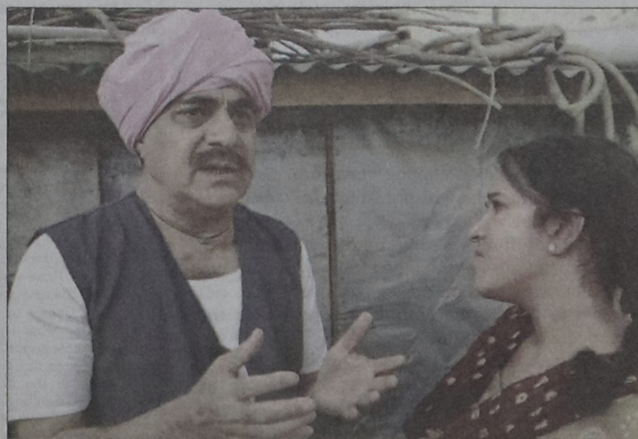
"Be-Libaas" poses a number of disquieting questions about power politics in the society.

IPTA's latest production, "Aetraaf-E-Ghalib" (Confessions of Ghalib), will have 10 shows all over India, while "Be-Libaas" will also go to various parts of the country. Here's hoping for more such hard-hitting fare from this leading theatre group.