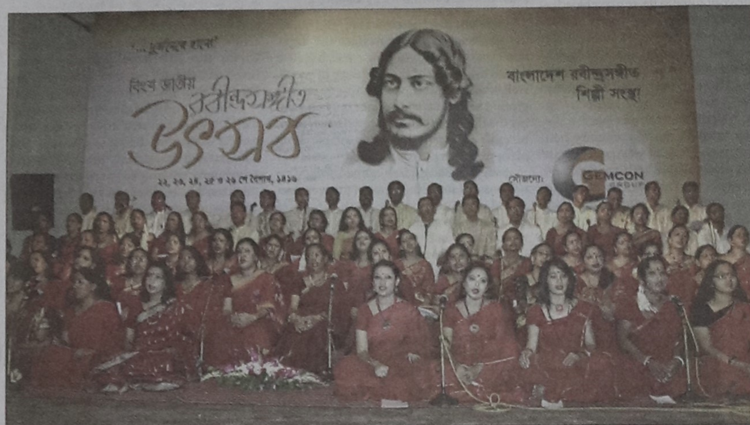
Over 100 Tagore artistes from and outside Dhaka are participating at the five-day festival.