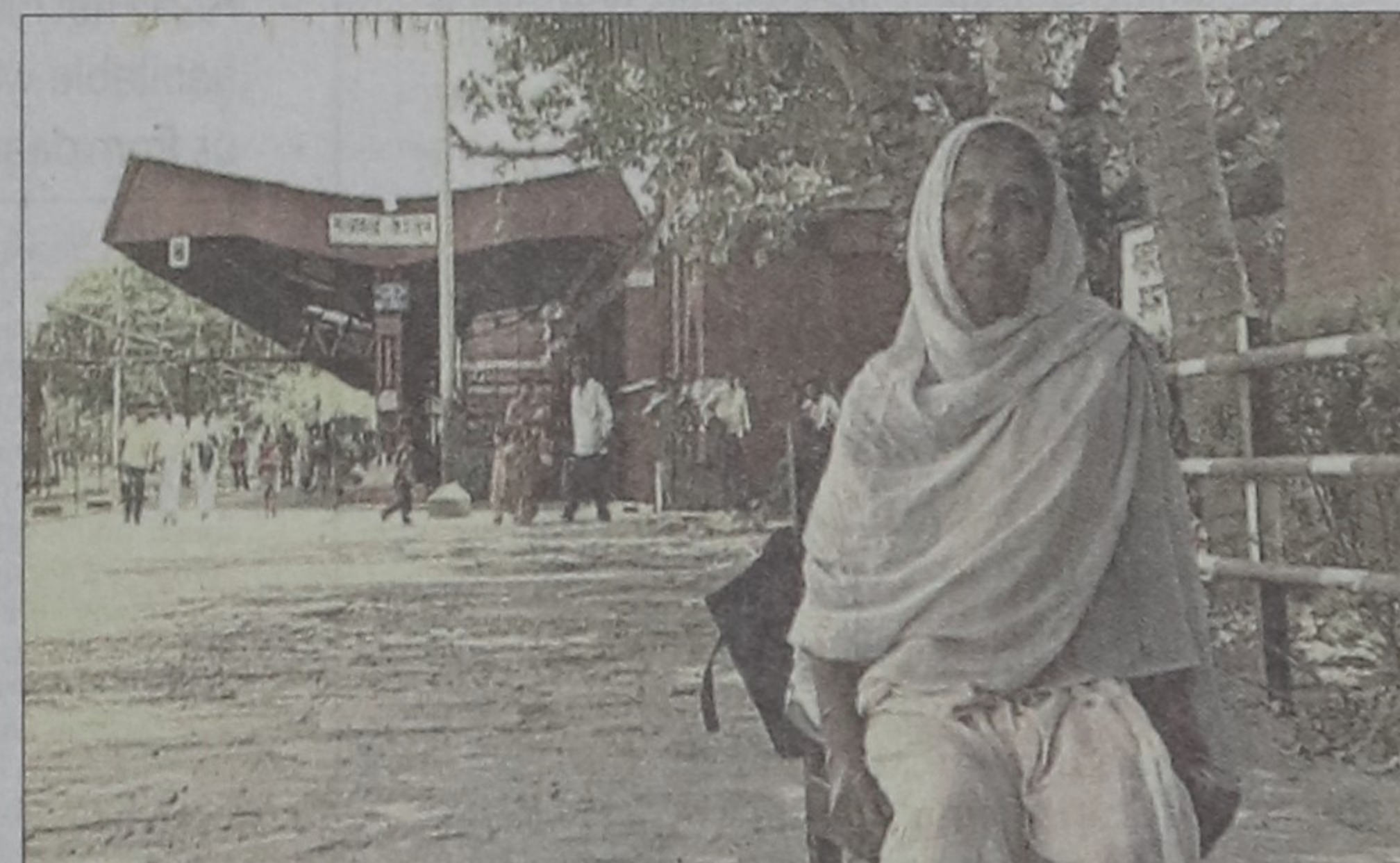
A scene from Tanvir Mokammel's "Swapnabhumi"