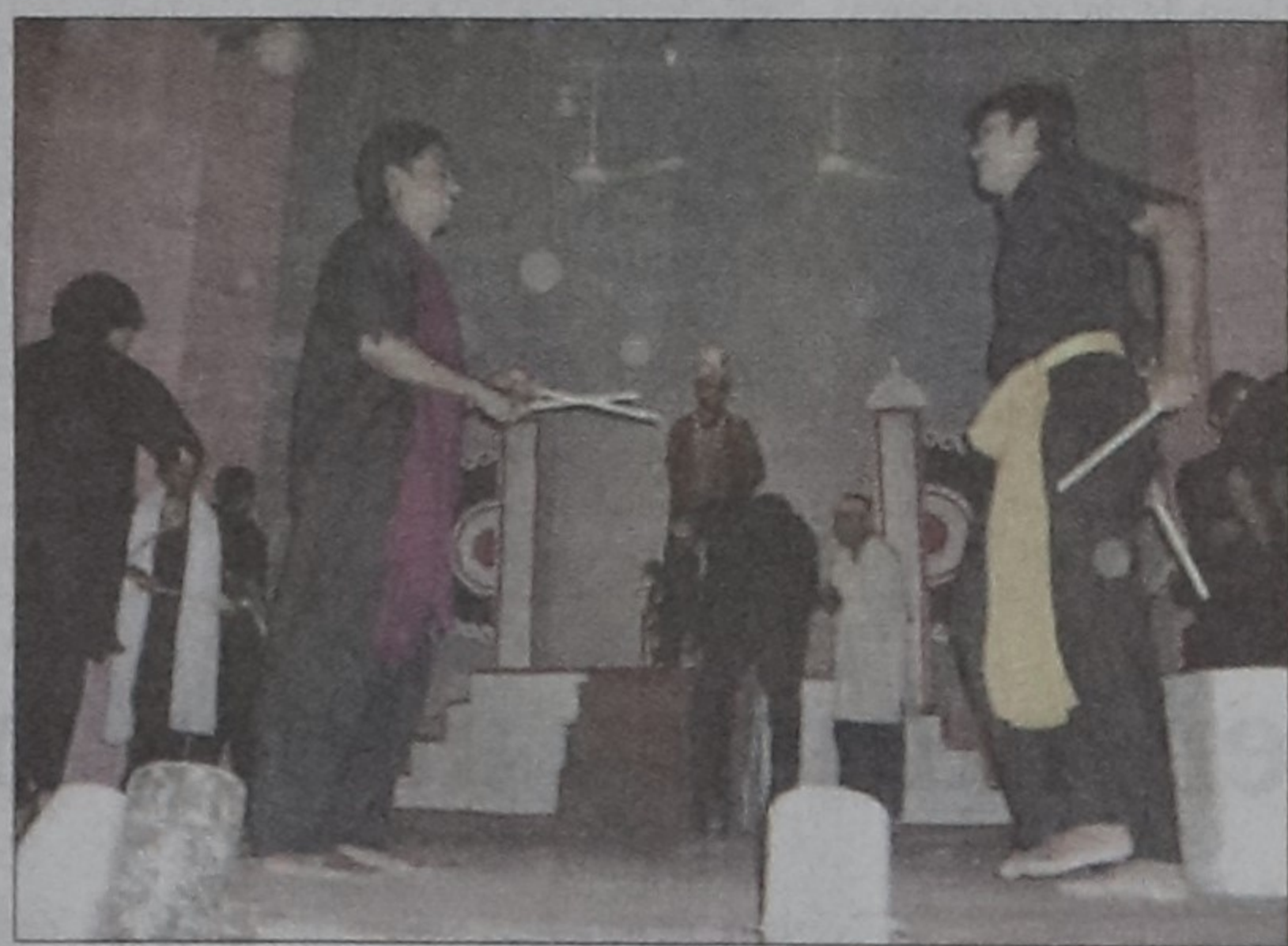
Actors of Pabna Drama Circle stage the play.

The speakers stressed the importance of theatre. As they said, "Theatre presents an authentic picture of society complete with its glaring