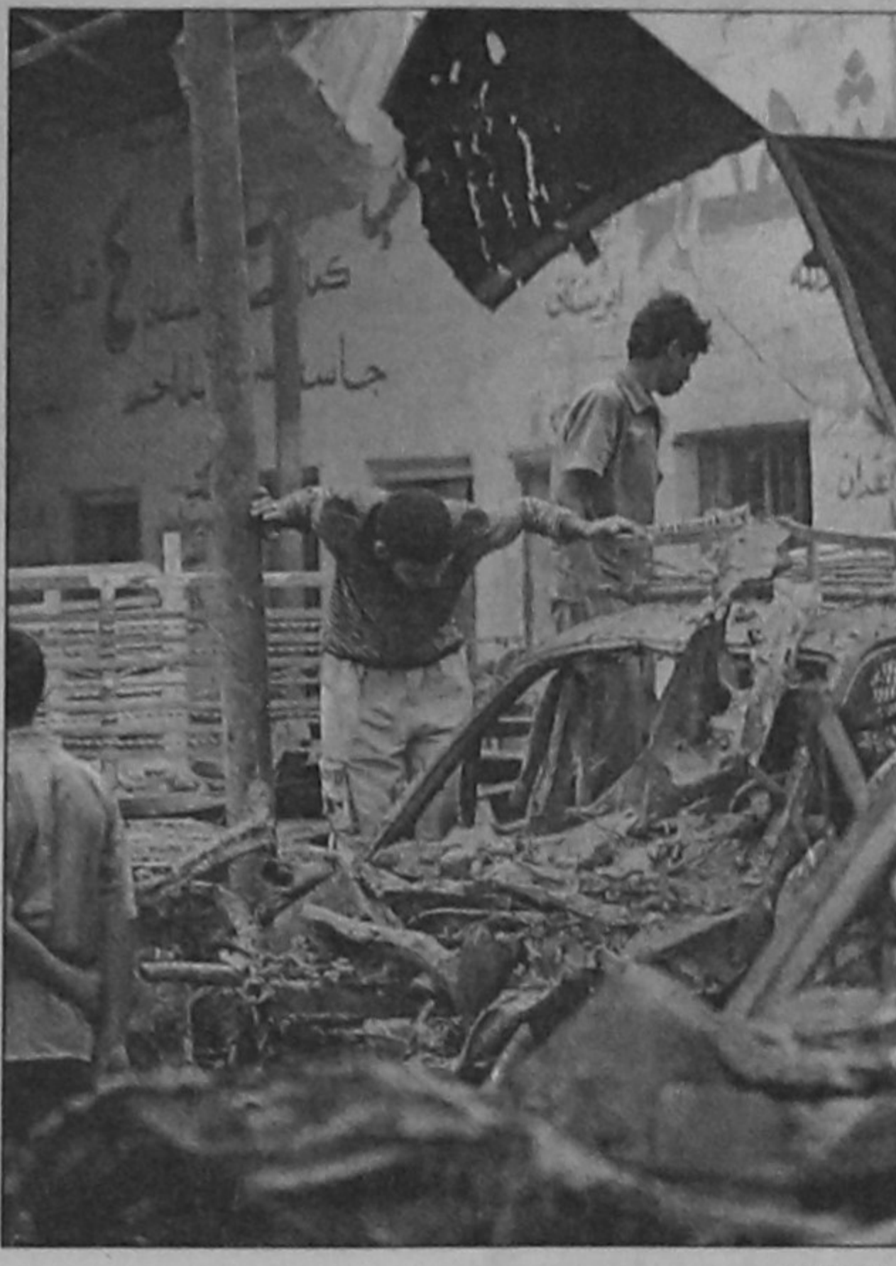
An Iraqi youth looks at a destroyed vehicle caught in the blast of a car bomb at a wholesale produce market near a mixed neighbourhood of Dura in southern Baghdad yesterday.

"Under the terms of the agreement this process may take 90 days although it could be longer if further information is required in relation to the application, or for another reason."