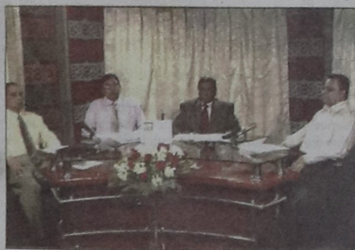
Discussants on the talk show.