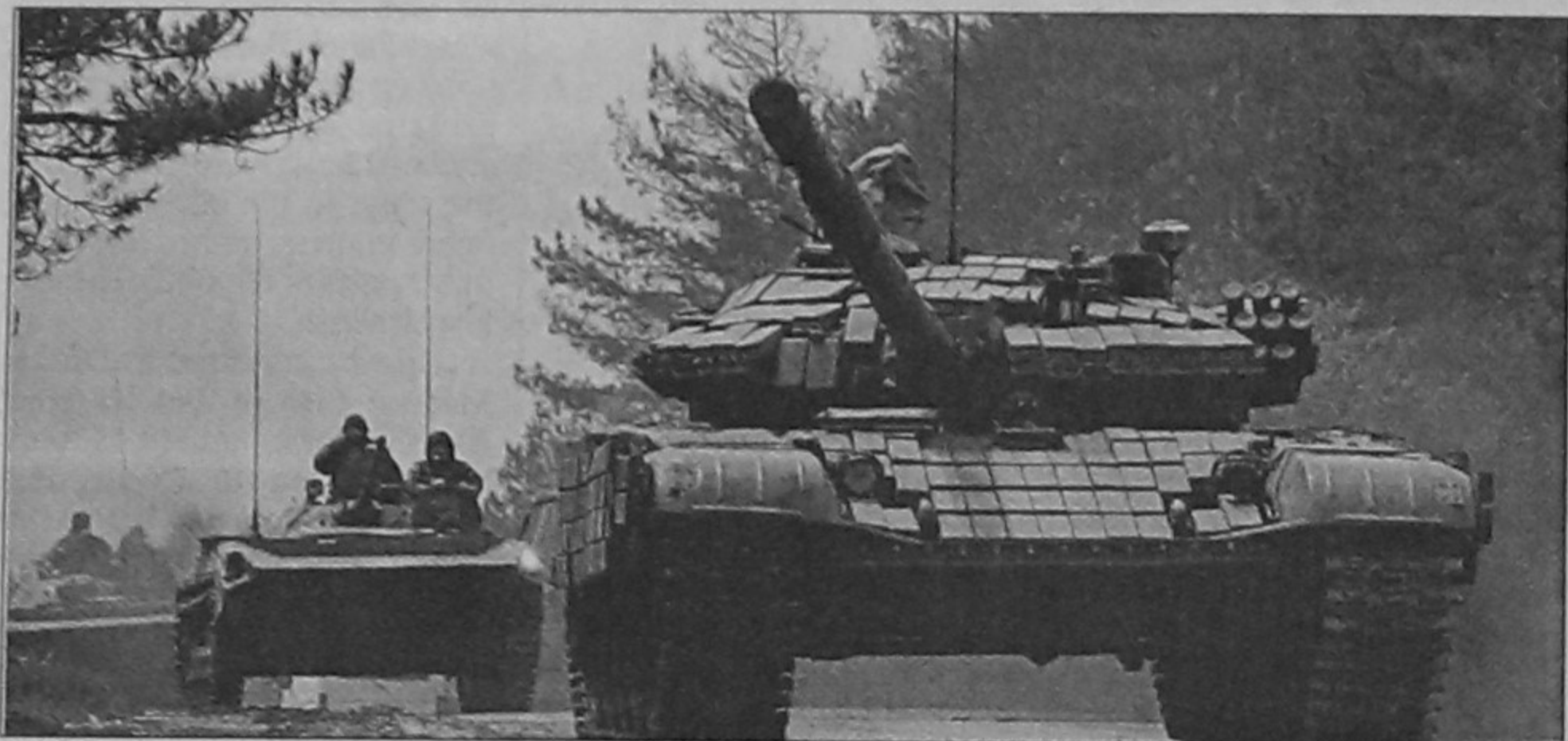
Georgian tanks move at a road outside Tbilisi yesterday after troops staged a mutiny on the eve of Nato exercises in the ex-Soviet republic, which the government said it ended without violence but accused Russia of backing the rebels.

Accusations of Russian involvement, angrily denied in Moscow, reignited diplomatic tensions which have remained high since a five day war between the neighbours last August.