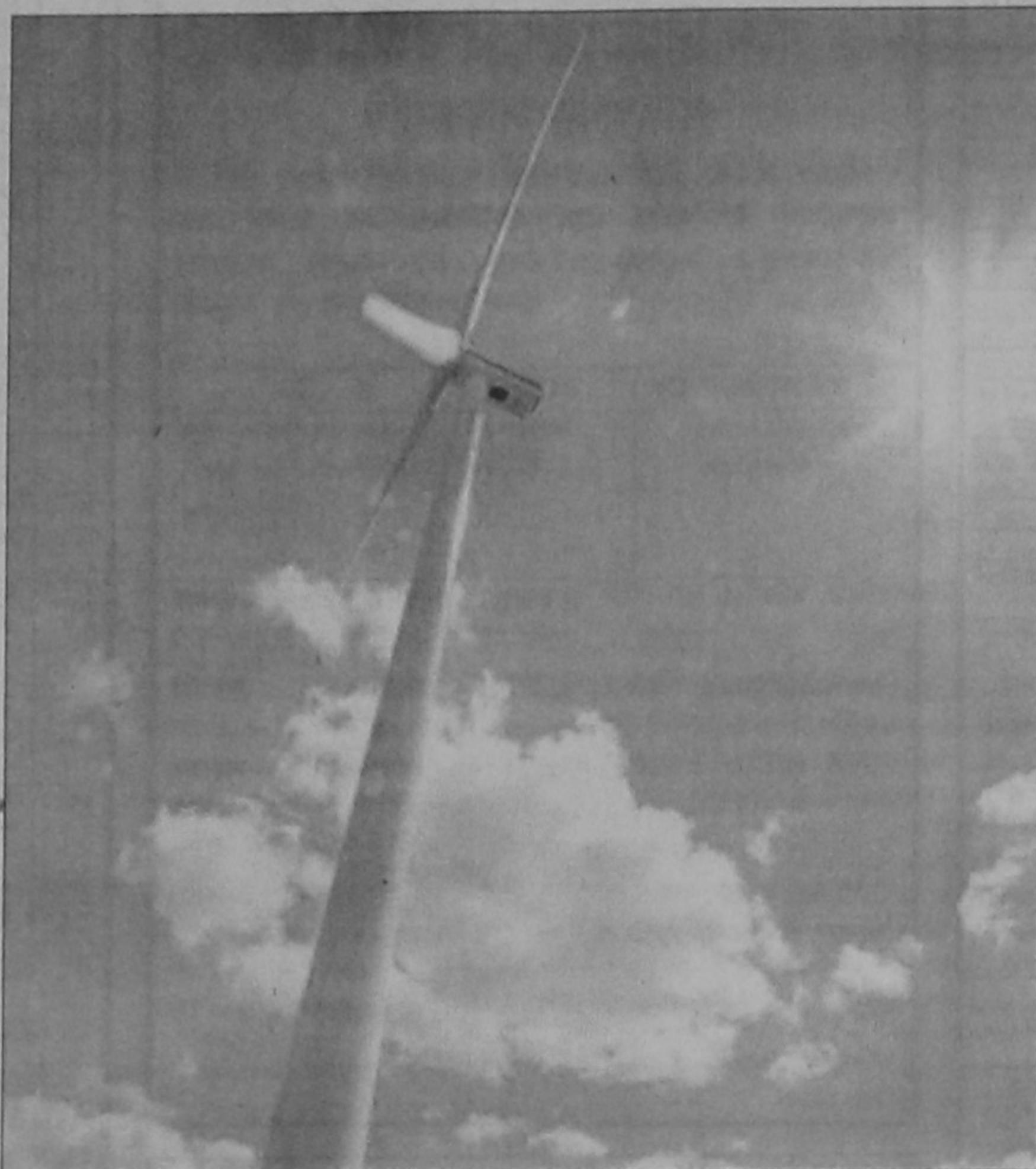
Energy from the sky.

At a research centre in Germany engineers at Daimler Chrysler have created a high performance car, which emits only water vapour. In Japan, scientists are perfecting paper-thin solar cells that could turn every house into its own electricity supplier. Cars like NECAR4 could help make that happen. This experimental vehicle, being jointly developed by Ford, Daimler Chrysler and Canada's Ballard Power systems, get its energy from hydrogen. Hydrogen, unlike fossil fuels, contains no carbon atoms and thus generates zero