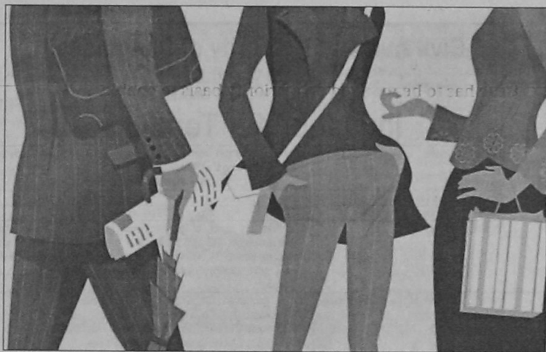
Pockets for you but no bags for me!

It is high time to do away with discriminatory decisions; decisions that are taken through the stroke of a pen by mighty men, without consulting those who are affected by these decisions; decisions that impinge upon the fundamental rights of a person. Articles 27 and 28 of the Constitution ensure equality