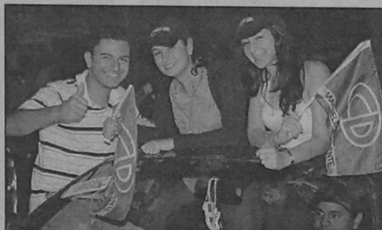
Supporters of Ricardo Martinelli of the Democratic Change party and presidential candidate for the Alliance for Change, celebrate his victory in the Panamanian elections on Sunday in the streets of Panama City.

Former National Security Council member Elliott Abrams opines that Obama has absorbed much of the foreign policy flak that would have gone Clinton's way.