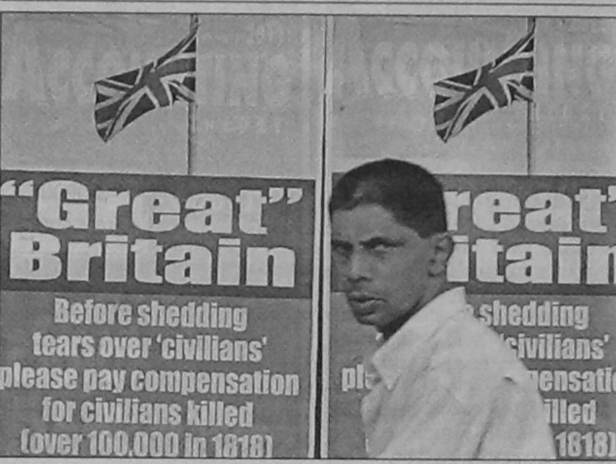
A Sri Lankan man walks past anti-British posters in Colombo yesterday. The posters came up as a British parliamentary delegation arrived in the capital to examine the island's humanitarian crisis following heavy fighting between troops and Tamil Tiger rebels.

located, and its concerns have intensified in the last two weeks, after Taliban fighters entered Buner, a district just 60 miles from the capital, the paper said.