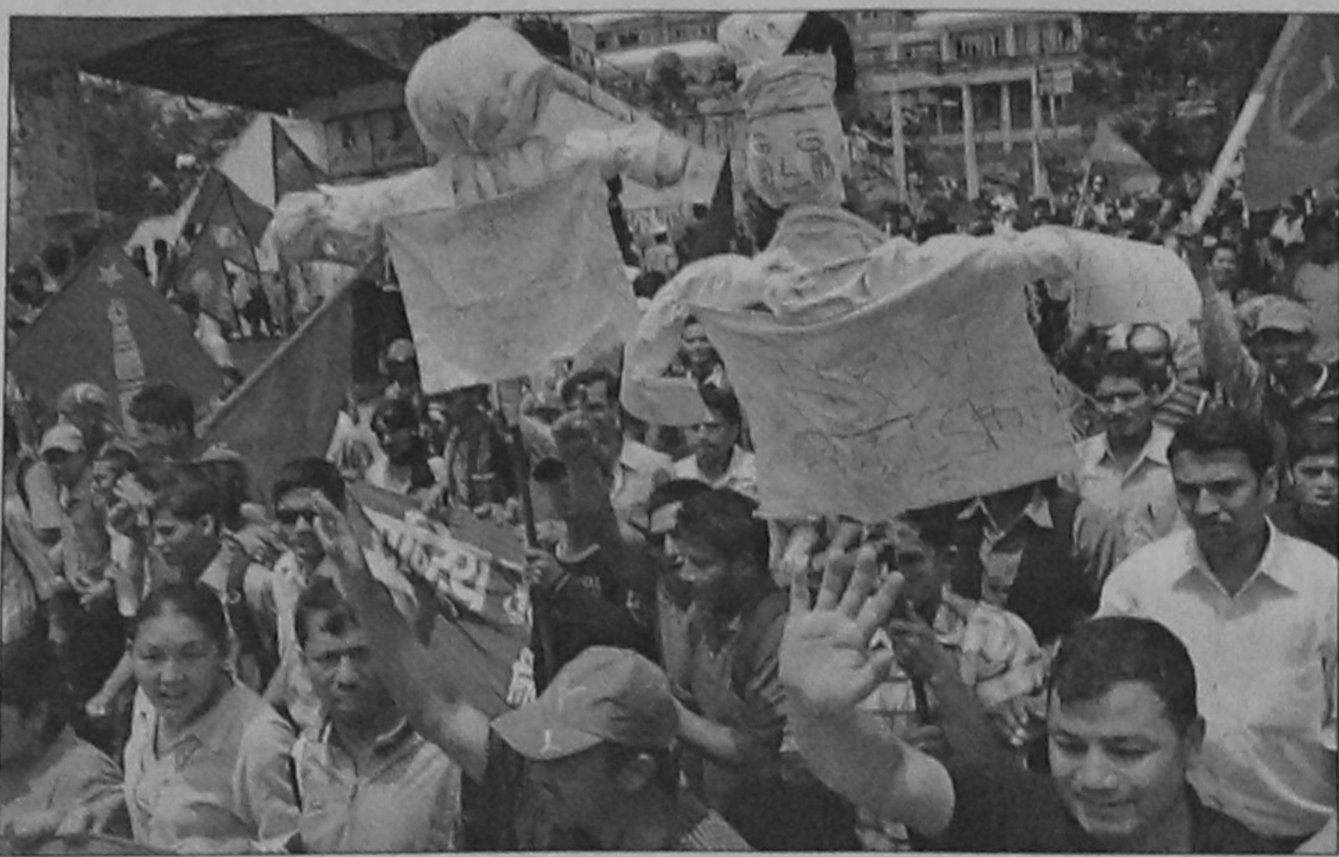
Nepalese pro-Maoist supporters take to the streets as they demonstrate prior to the resignation of Nepalese prime minister Pushpa Kamal Dahal, also known as Prachanda, in Kathmandu yesterday.