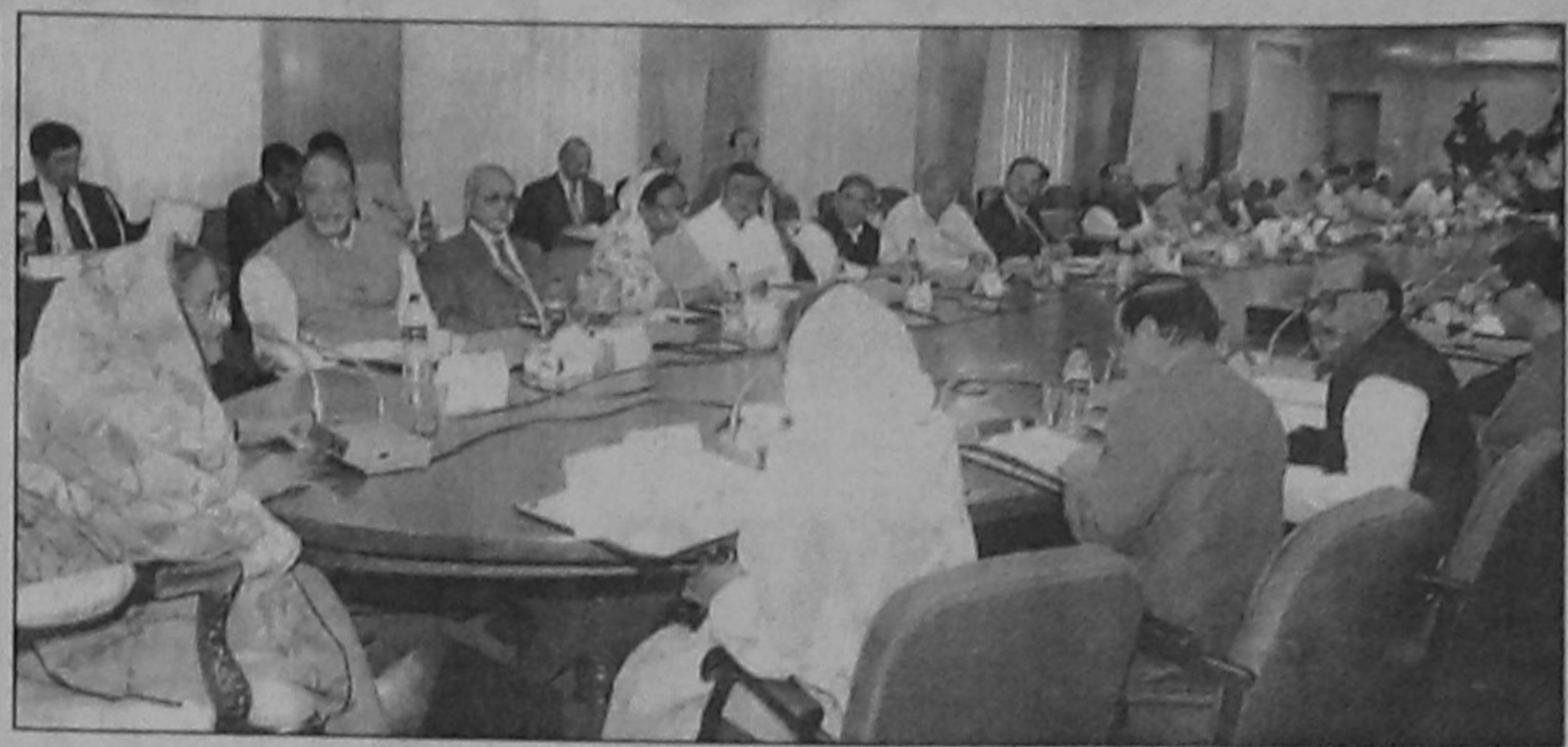
Prime Minister Sheikh Hasina presides over the cabinet meeting at Bangladesh Secretariat in the city yesterday. (Story on Page 1)