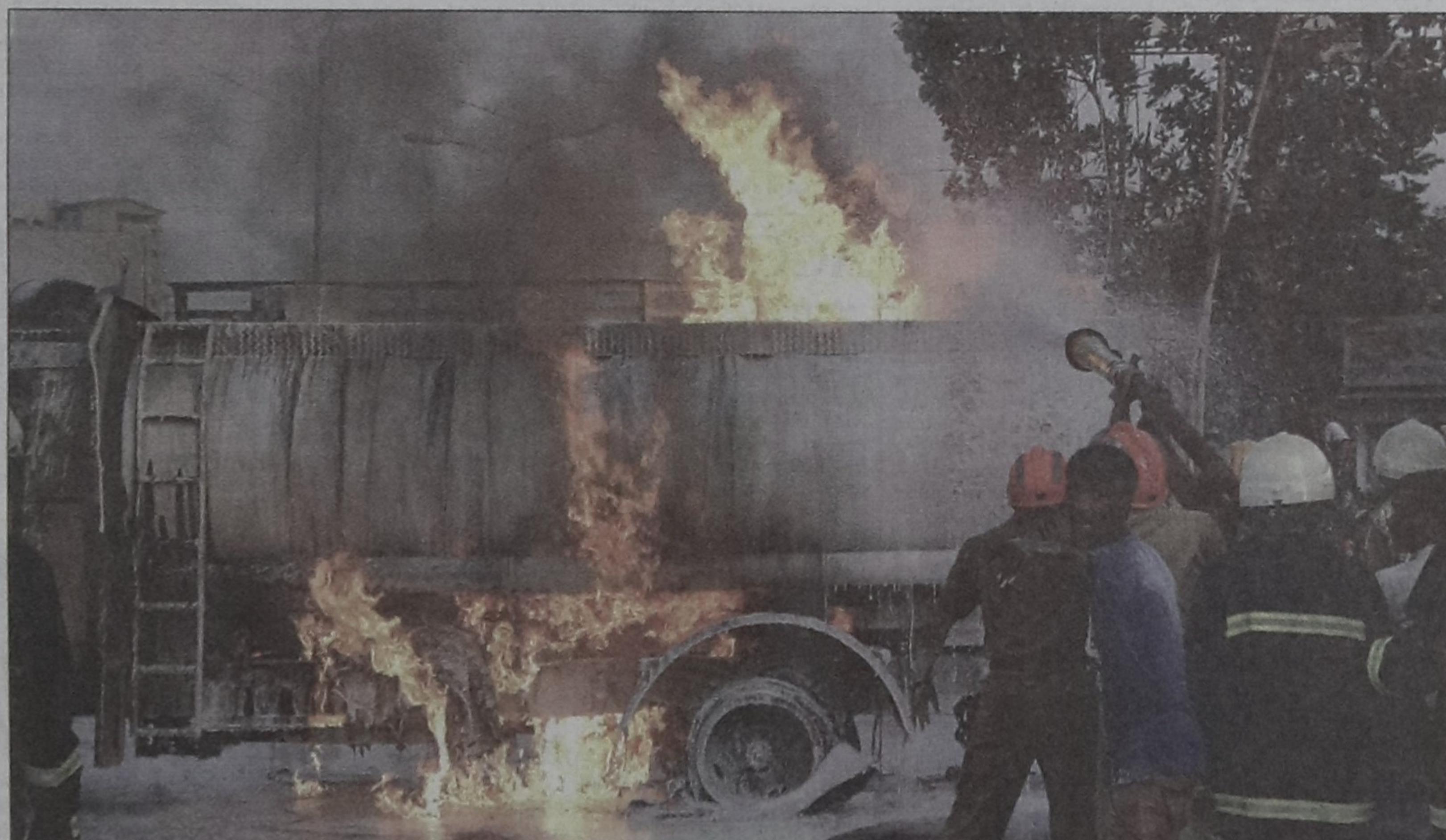
Fire-fighters try to put out the blaze engulfing an oil lorry of Amam Enterprise near a CNG refuelling station at Mohakhali in the capital.