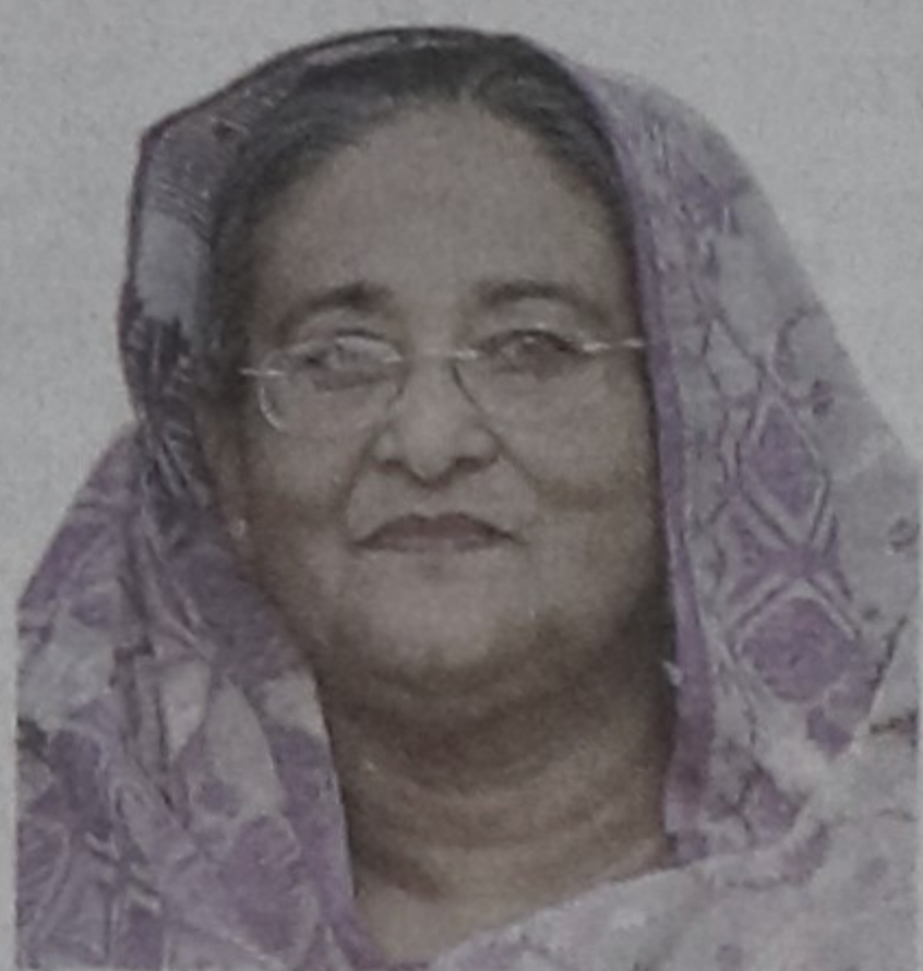
ministers and the current pace of administrative activities.

Sources said the premier was not happy about the performance of many