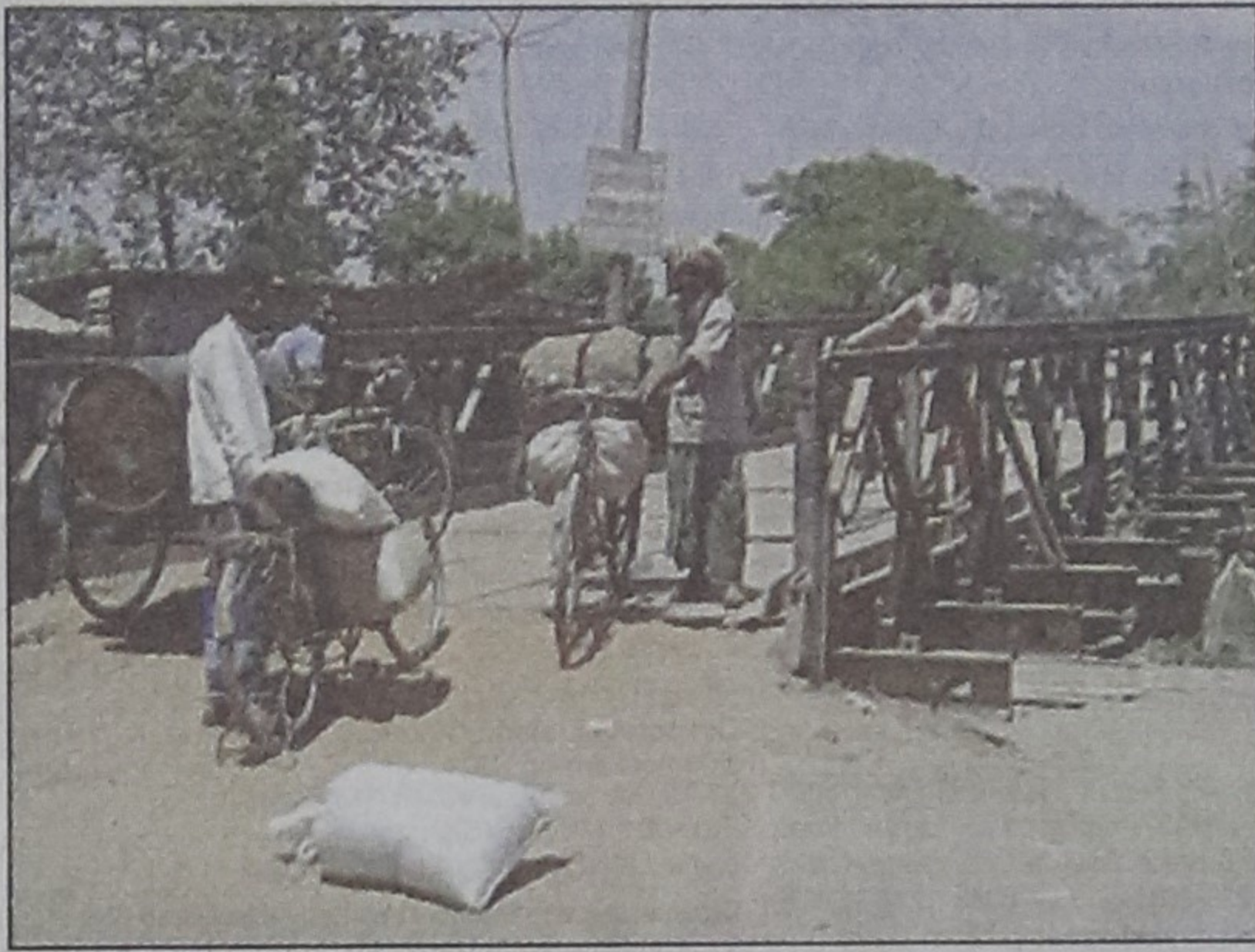
RISKY DRIVE: These two awfully dilapidated bailey bridges, one at Sakoa of Gaibandha-Palashbari road, left, and the other at Badiakhali Bazar of Gaibandha-Fulchhari road, are among at least six such structures in Gaibandha. The bridges, set as temporary substitute for the concrete ones several years ago, still await replacement.