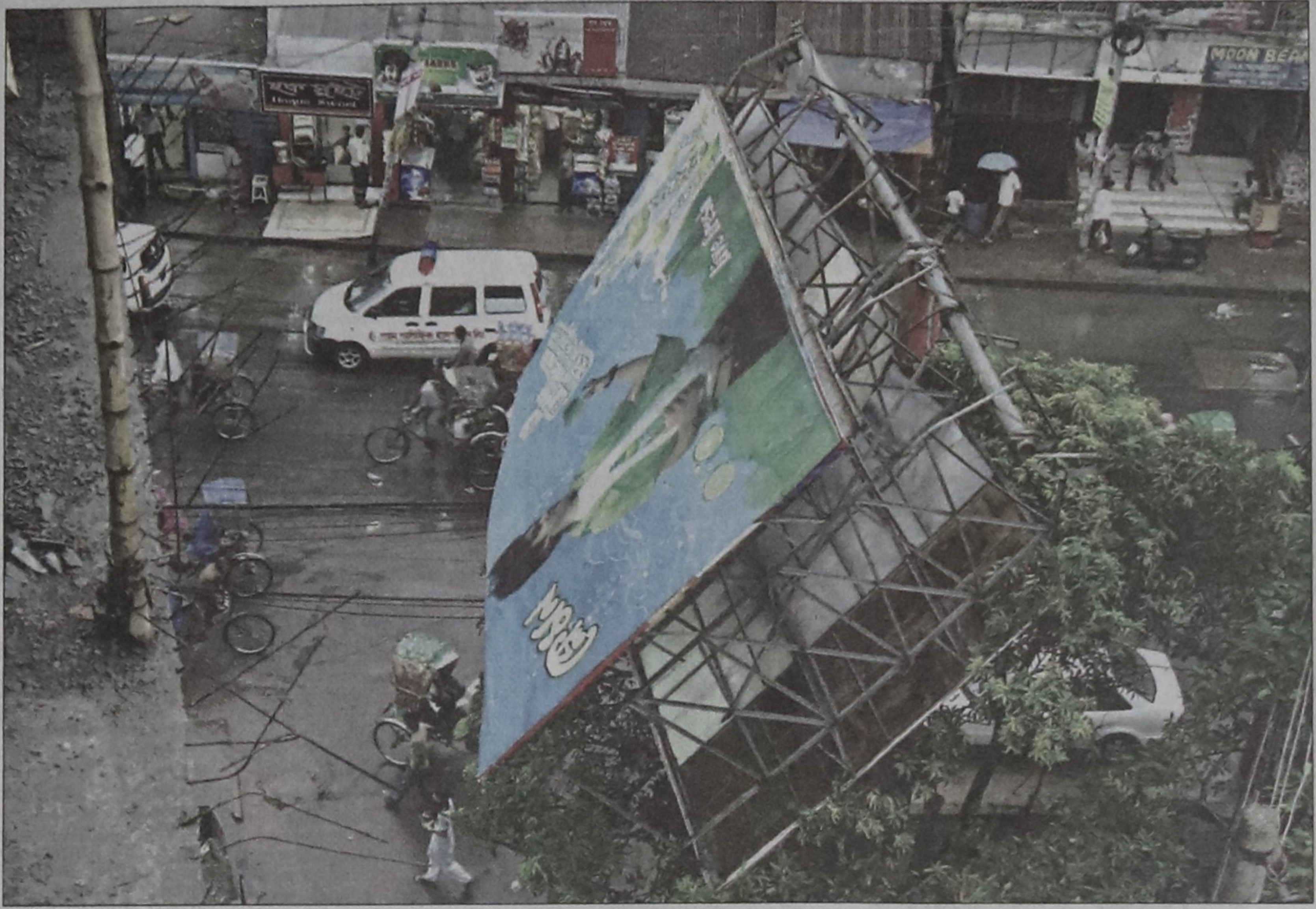
A large number of hoardings in the capital pose a threat to the city dwellers especially during storms as authorities concerned hardly conduct any drives against unauthorised billboards or take proper initiatives to set those up in a safe way. One such hoarding on Bailey Road in front of Siddheswari Girls' High School in the capital broke during yesterday's storm but luckily none was hurt.