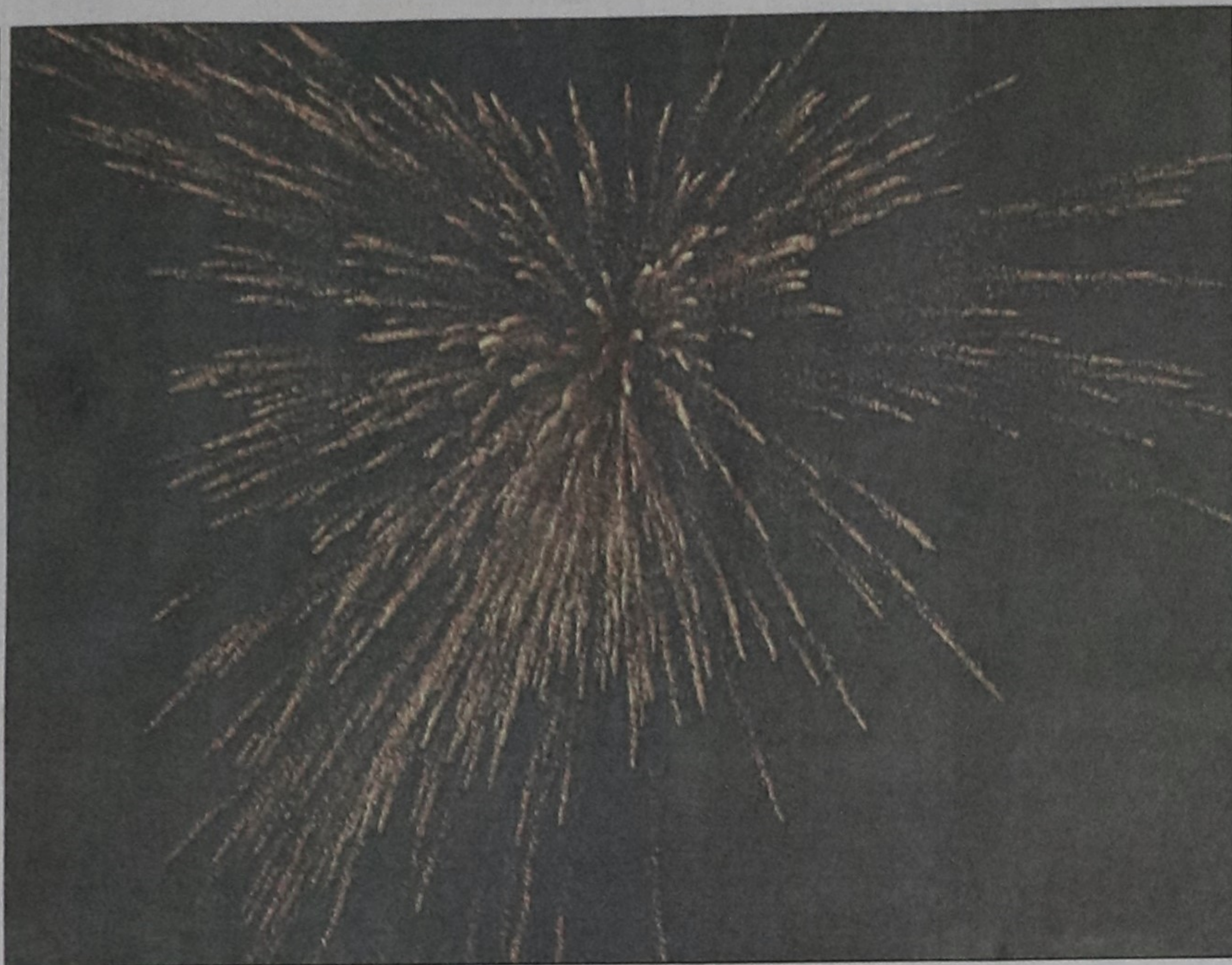
Fireworks light up the sky over the MA Aziz Stadium in Chittagong yesterday to mark the opening ceremony of the glamorous Twenty20 tournament in the country. The event titled Habib Group Port-city Cricket League (PCL) features eight teams and will run till May 10.