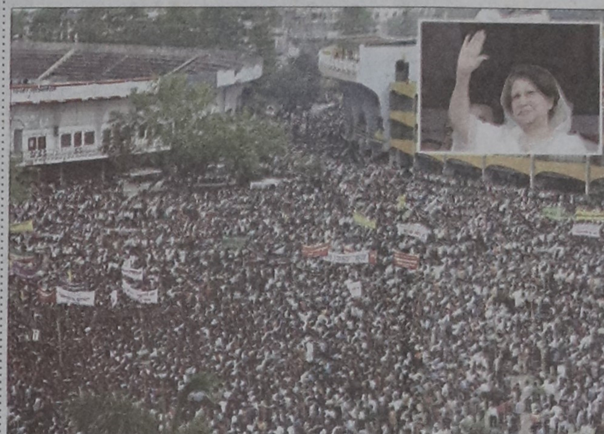
The workers' wing of main opposition BNP, Sramik Dal, organised a rally at Paltan Maidan yesterday on the occasion of May Day. Inset BNP Chairperson Khaleda Zia greets the audience.