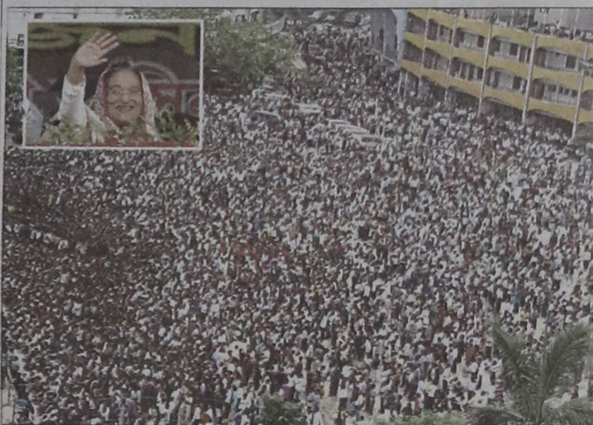
Thousands of people gather at a rally organised by Sramik League, workers' wing of Awami League, at Paltan Maidan on Friday, marking May Day. Inset PM and AL President Sheikh Hasina waves at the crowd.