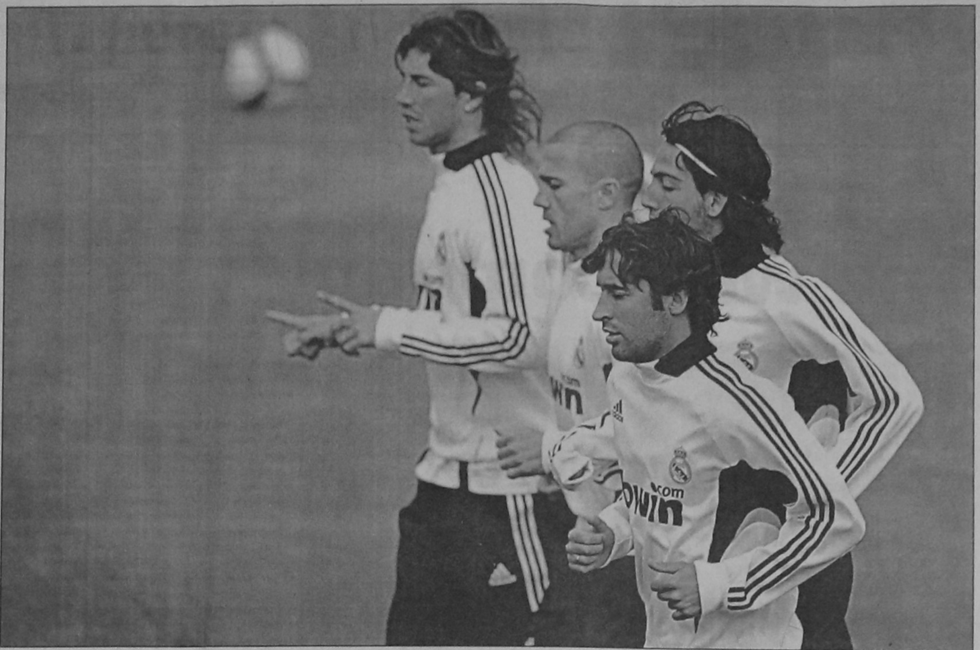
Real Madrid captain Raul (front) runs with teammates during a training session in Madrid on Thursday. Real Madrid will play 'El Clasico' match against arch-rivals Barcelona on Saturday.

"When you play at home and you know you can go to a final, you will be up for it."