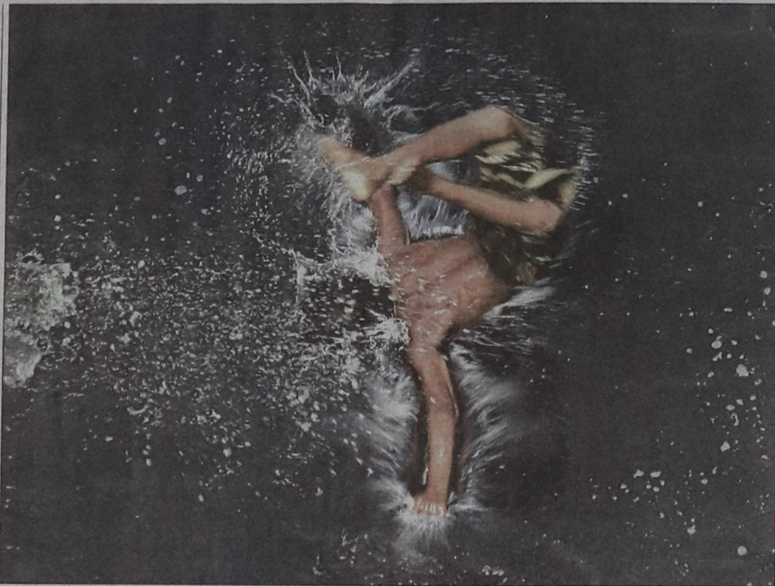
A preteen somersaults into Kadda river, upstream of the Turag, under Kadda Bridge in Kallakoir of Gazipur yesterday, unaware of the state of the river water, which lost its colour as waste of nearby industries contaminates the water only a few metres away.