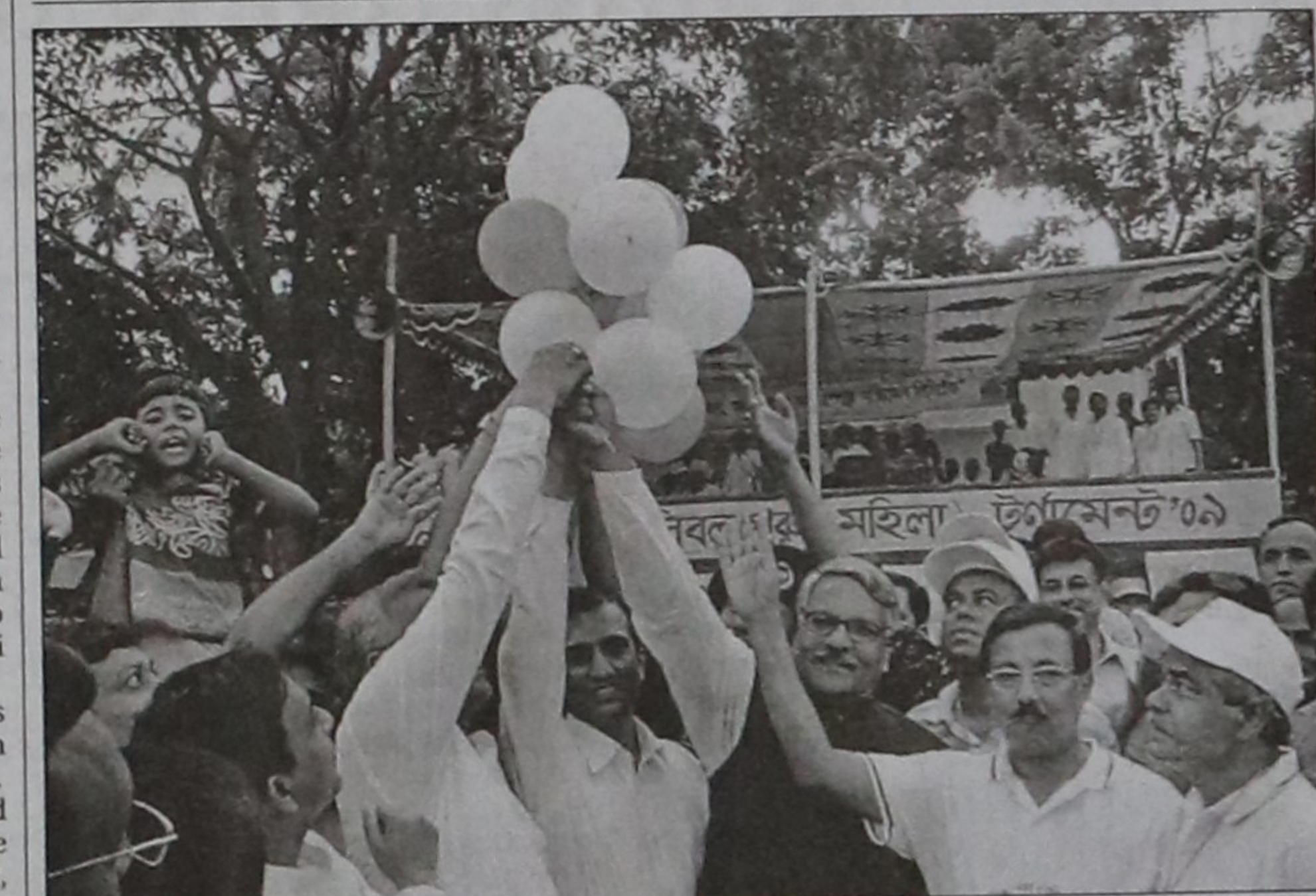
State Minister for Power and Energy Advocate Samsul Haque Tuku inaugurates the Spectra National Volleyball Championship at Shara Marwar School in Pabna yesterday.

"Yeah, I'm 32, but there's no reason why I can't bowl faster. I'm the fittest I've been in a long, long time, provided the ankle holds up," said Lee, regarded as the world's fastest bowler alongside Pakistan's Shoaib Akhtar.