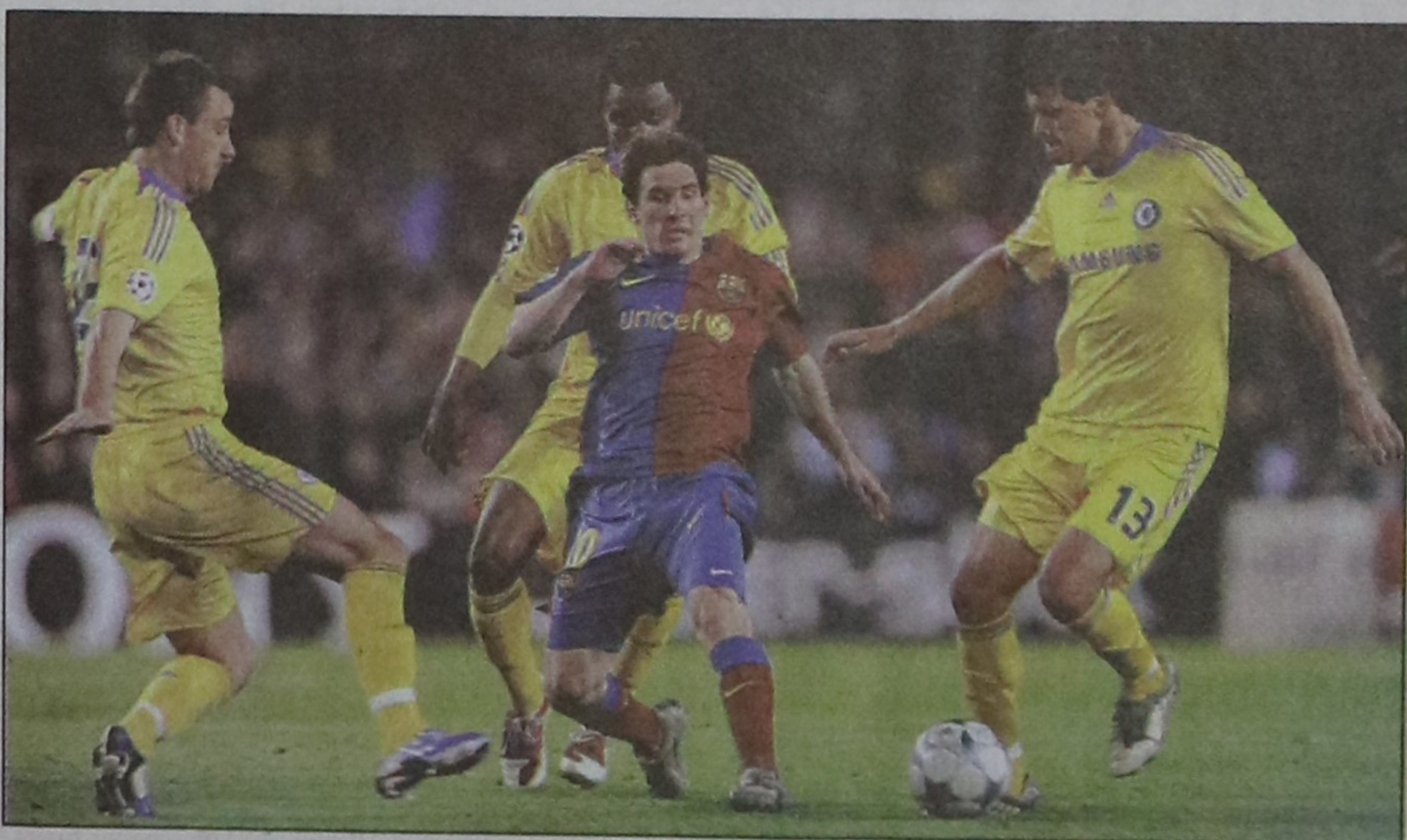
NO SPACE ALLOWED: Barcelona's Argentine star Lionel Messi (C) is surrounded by three Chelsea players John Terry (L), Michael Essien (behind Messi) and Michael Ballack (R) during their Champions League semifinal first-leg match at Nou Camp on Tuesday.

RESULT: Kings XI Punjab won by three runs.