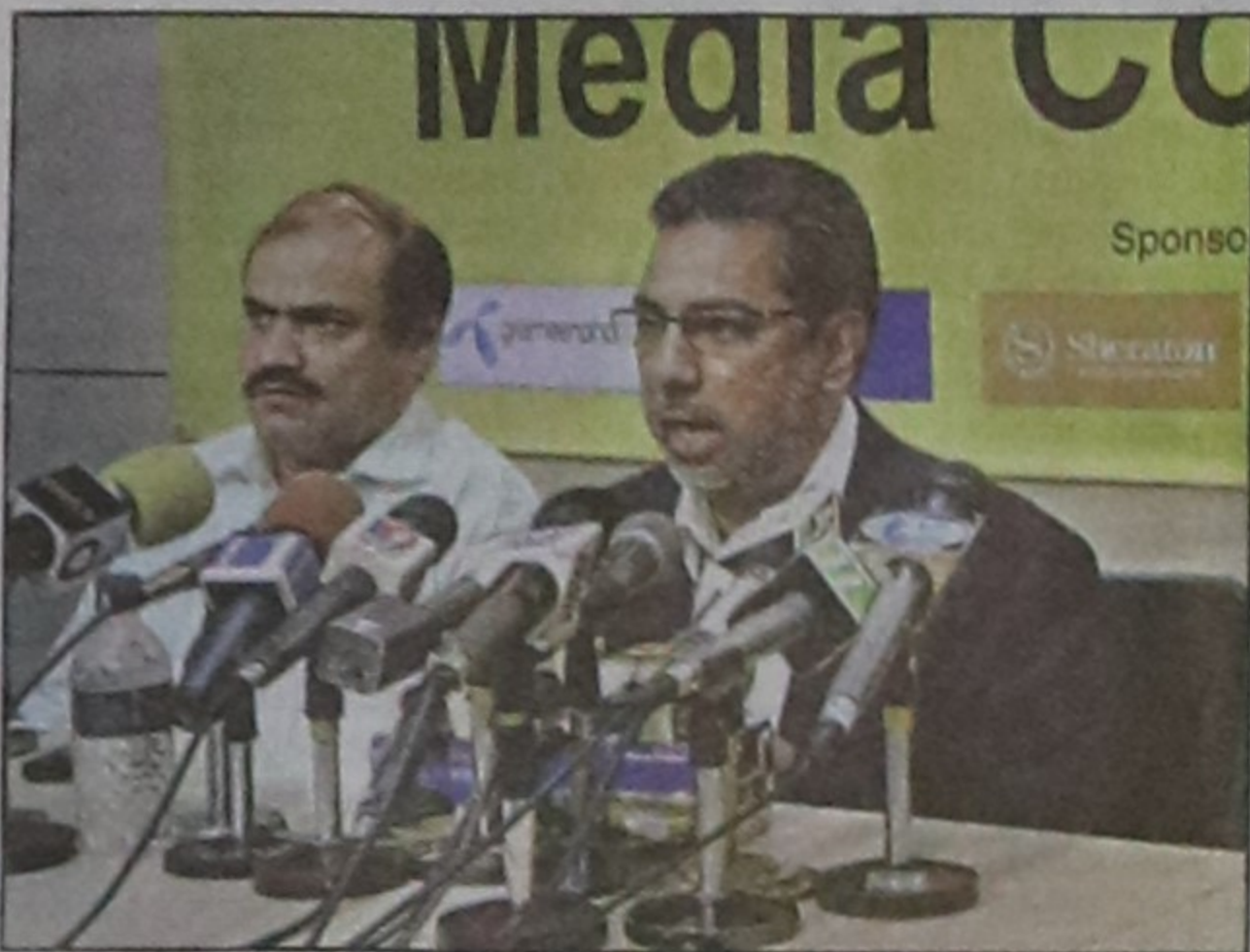
Bangladesh Cricket Board (BCB) senior vice-president Mahbubul Anam (R) speaks at a press conference at the Sher-e-Bangla National Stadium in Mirpur yesterday.

Bangladesh Cricket Board (BCB) sought the government's all-out support after it was awarded eight matches of the 2011 ICC World Cup.