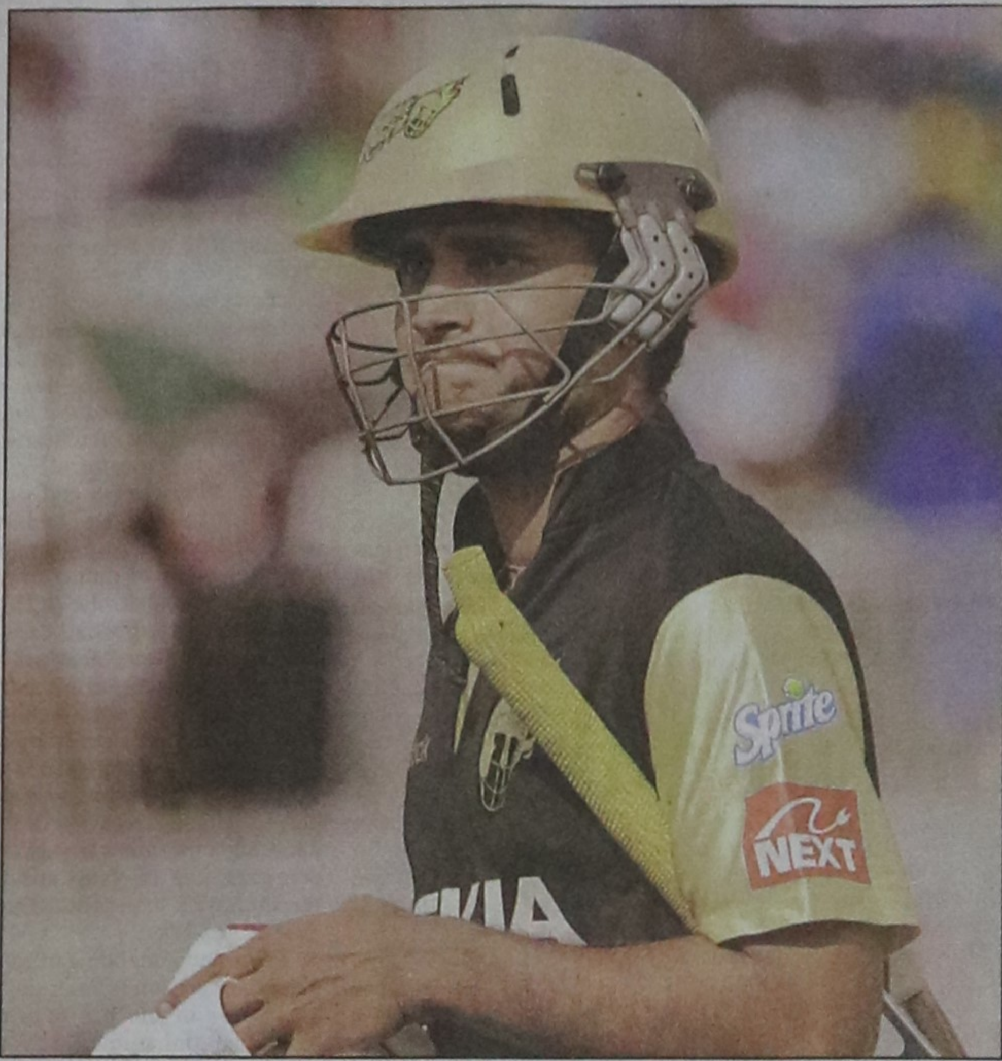
NO FUN FOR KNIGHT RIDERS: A grim-faced Sourav Ganguly of Kolkata Knight Riders walks off the field after his dismissal during an IPL Twenty20 match against Royal Challengers Bangalore at Kingsmead, Durban yesterday.