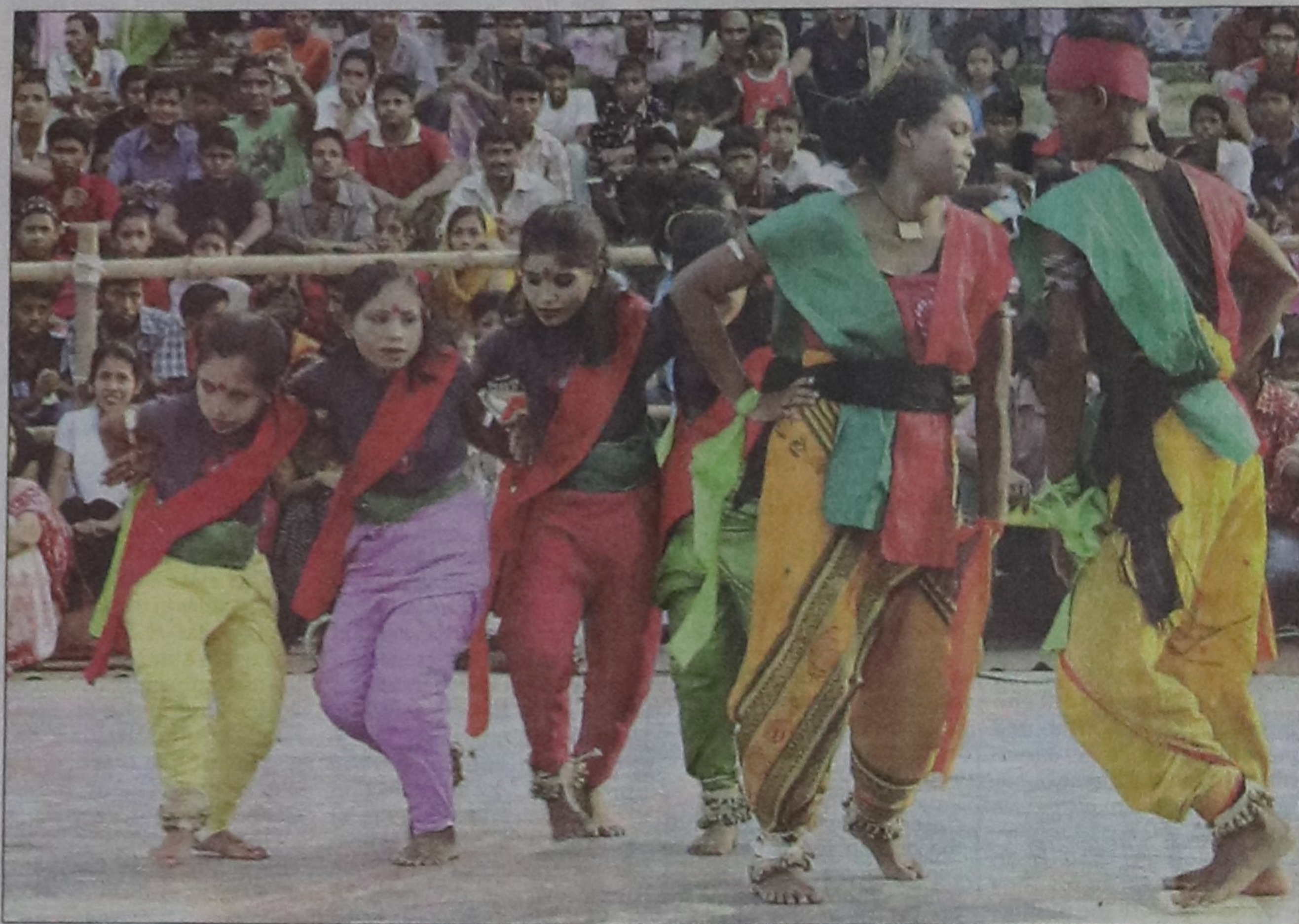
Children perform a dance at a cultural programme as part of the Youth Partnership Programme project at Rabindra Sorobar at Dhanmondi in the city yesterday. Aparajeyo Bangladesh organised the event.

Eleven of the injured were admitted to Natore Sadar Hospital in a critical condition.