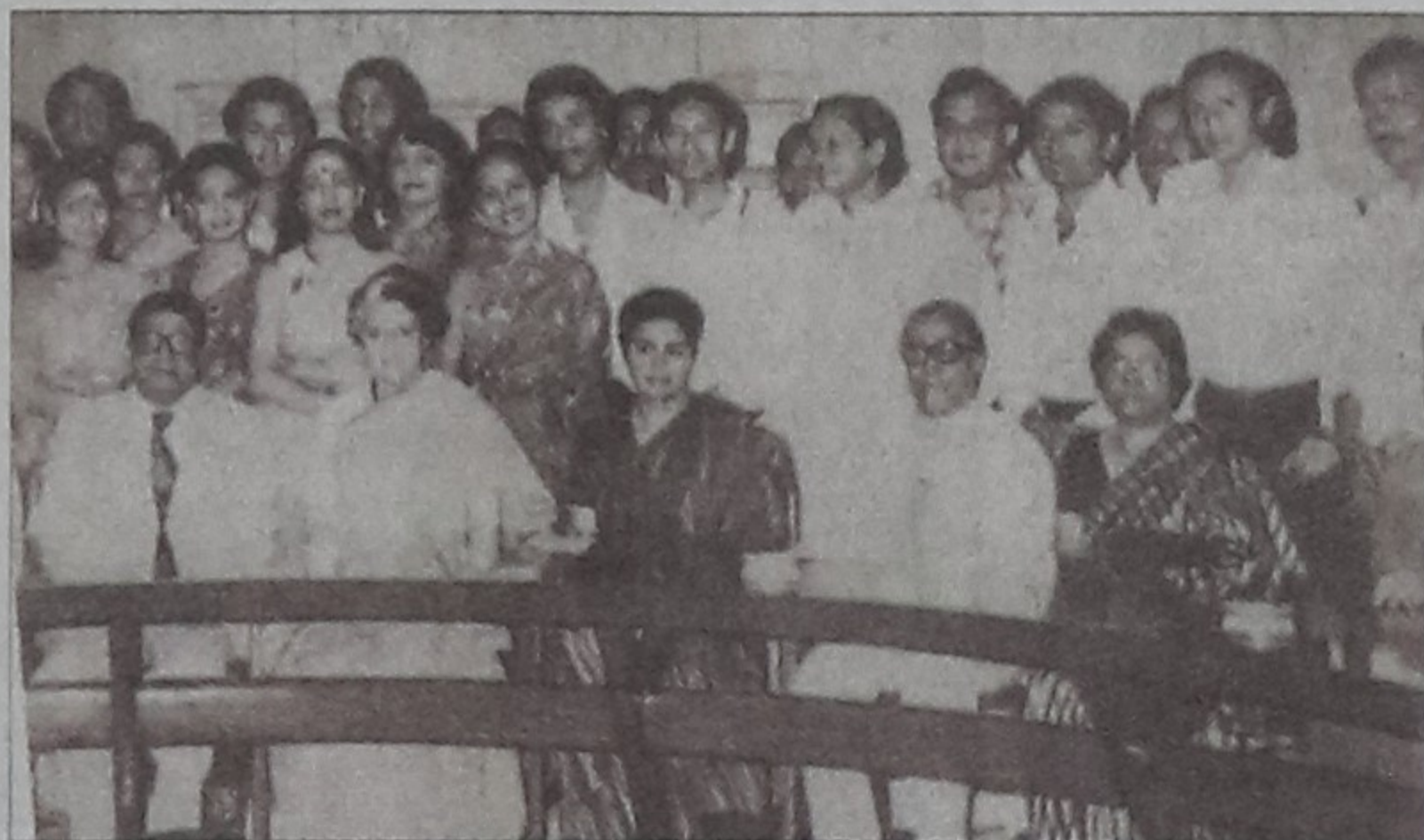
A national delegation of Bangladeshi dancers with Indira Gandhi (1st row- 2nd from left), the then Prime minister of India.