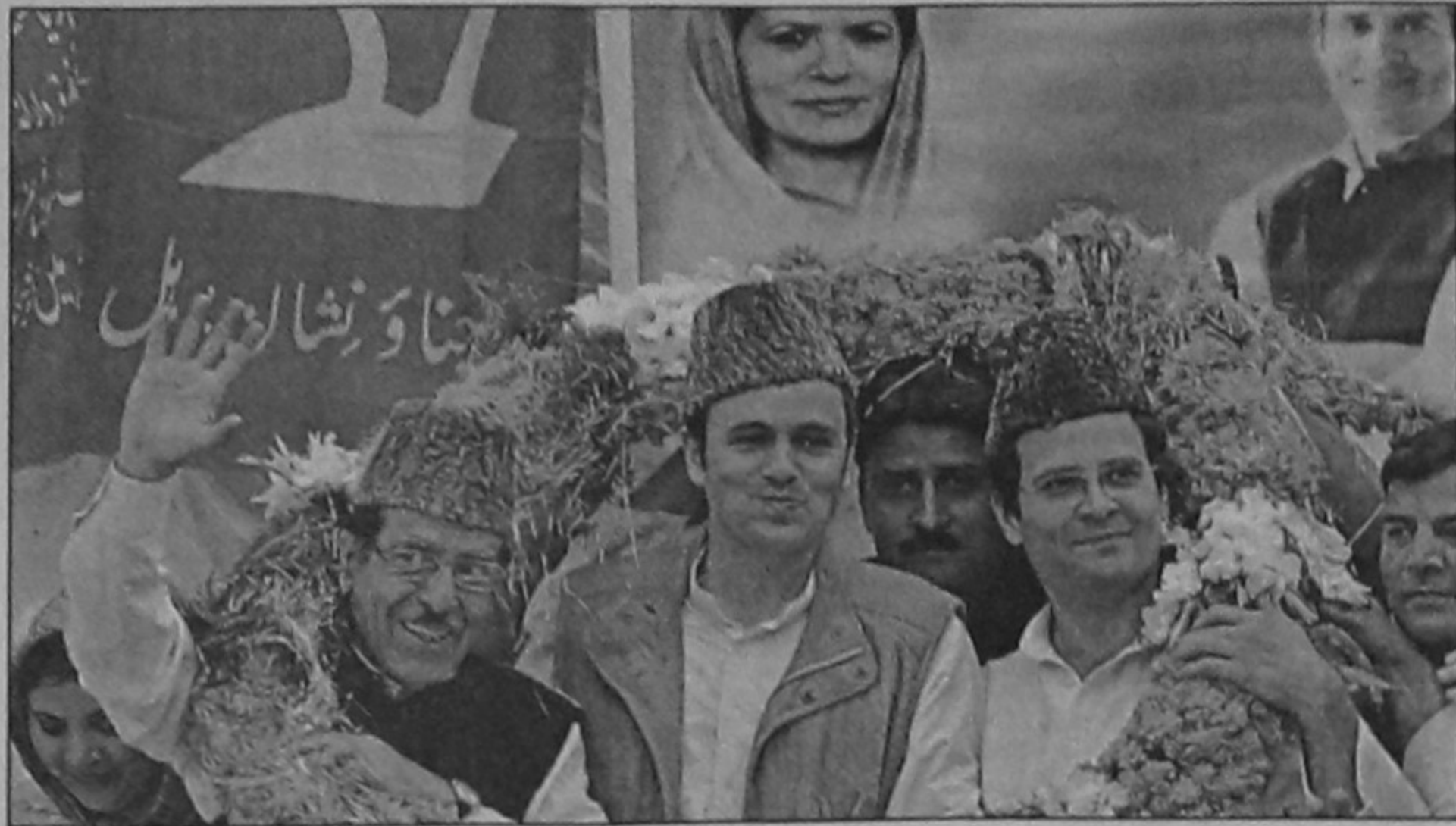
Congress general secretary Rahul Gandhi (R), Jammu and Kashmir Chief Minister Omar Abdullah (C) and Indian Minister for Water Resources Salfuddin Soz (L) are garlanded during an election campaign rally at Anantnag, south of Srinagar, on Monday. The rally was jointly organised by the ruling Congress party and National Conference (NC) in support of NC candidate Mehboob Beg from the Anantnag parliamentary constituency.