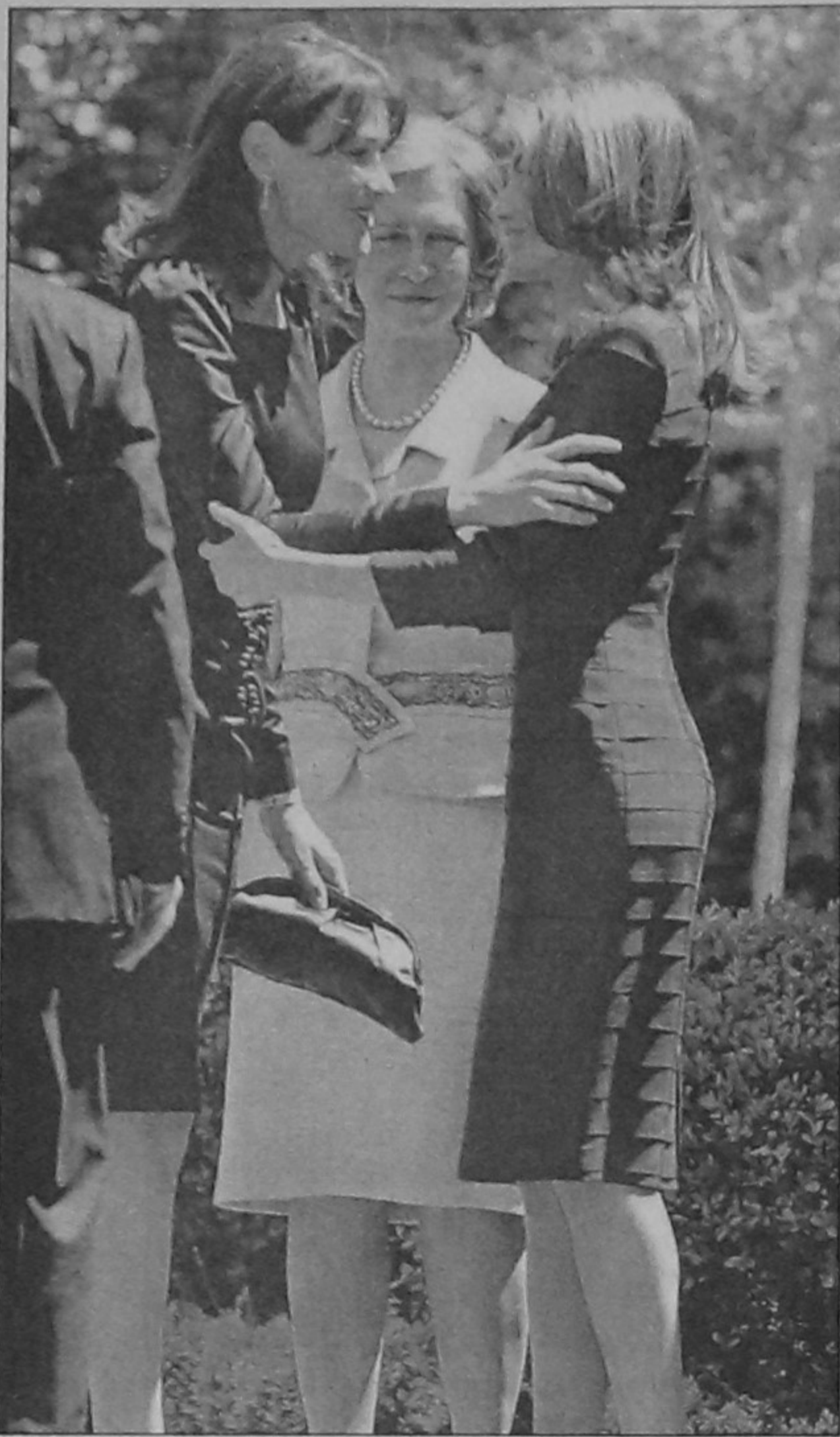
French President Nicolas Sarkozy's wife Carla Bruni-Sarkozy (L), Spain's Queen Sofia (C) and Spain's Princess Letizia (R) meet for lunch at the Zarzuela Palace in Madrid yesterday.